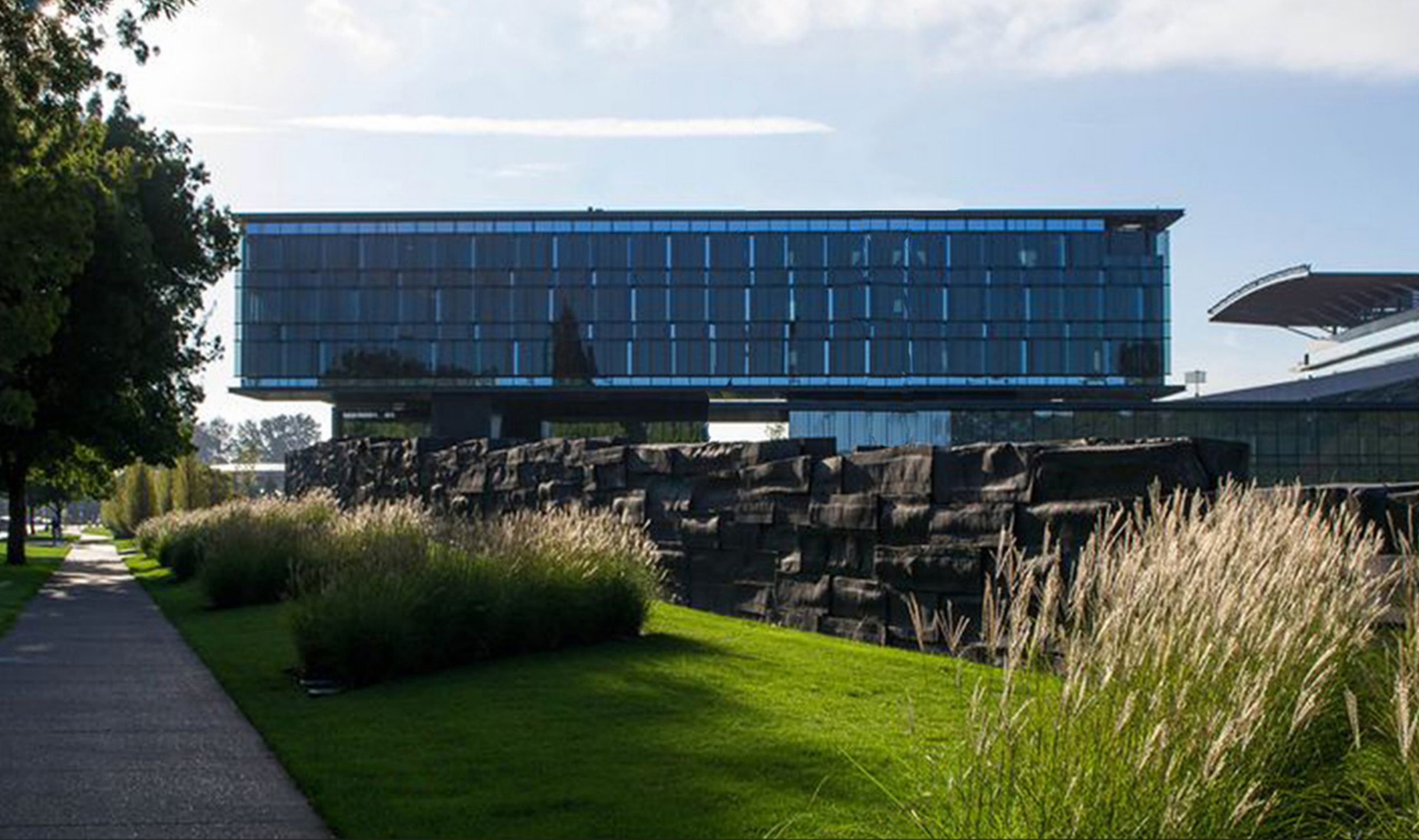
The Spirit of Gladiators: The perimeter wall is constructed of cut black basalt slabs hung on a concrete retaining wall. The slabs are open jointed and carefully installed to maintain tight joinery while showcasing the raw mass of the stone.