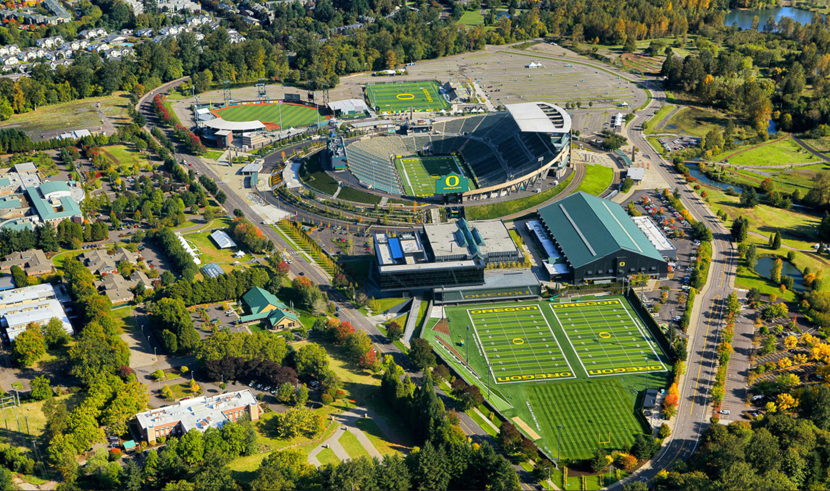
After: The project has transformed a distant and under-appreciated site away from the central core into an iconic high-performance campus amenity evident in its form and function.