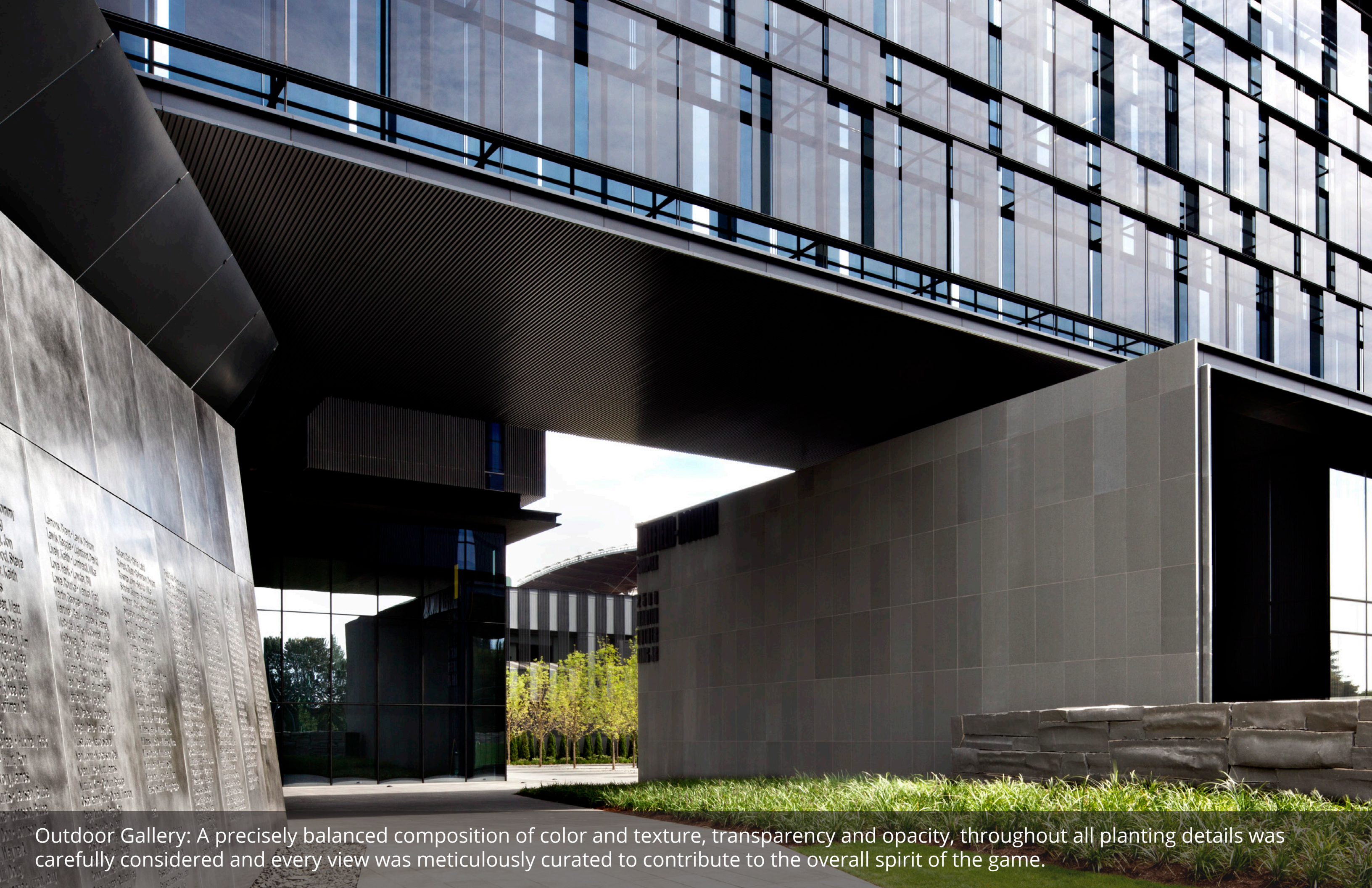
Outdoor Gallery: A precisely balanced composition of color and texture, transparency and opacity, throughout all planting details was carefully considered and every view was meticulously curated to contribute to the overall spirit of the game.