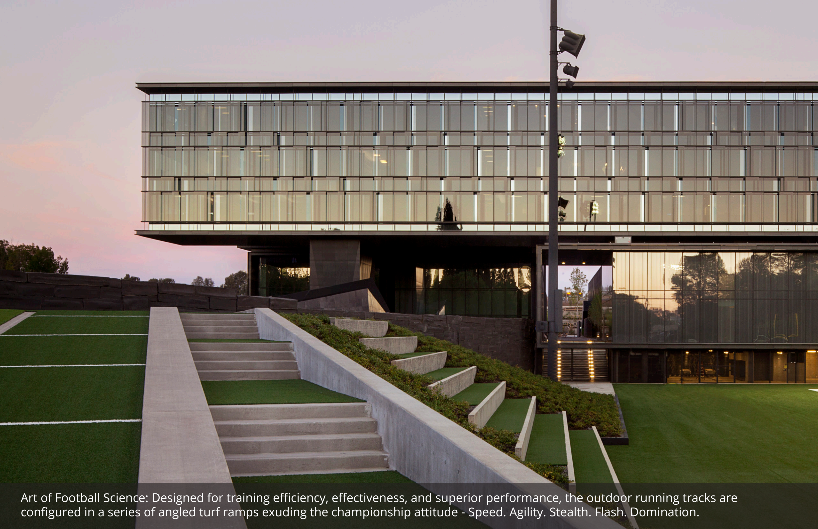
Art of Football Science: Designed for training efficiency, effectiveness, and superior performance, the outdoor running tracks are configured in a series of angled turf ramps exuding the championship attitude - Speed. Agility. Stealth. Flash. Domination.