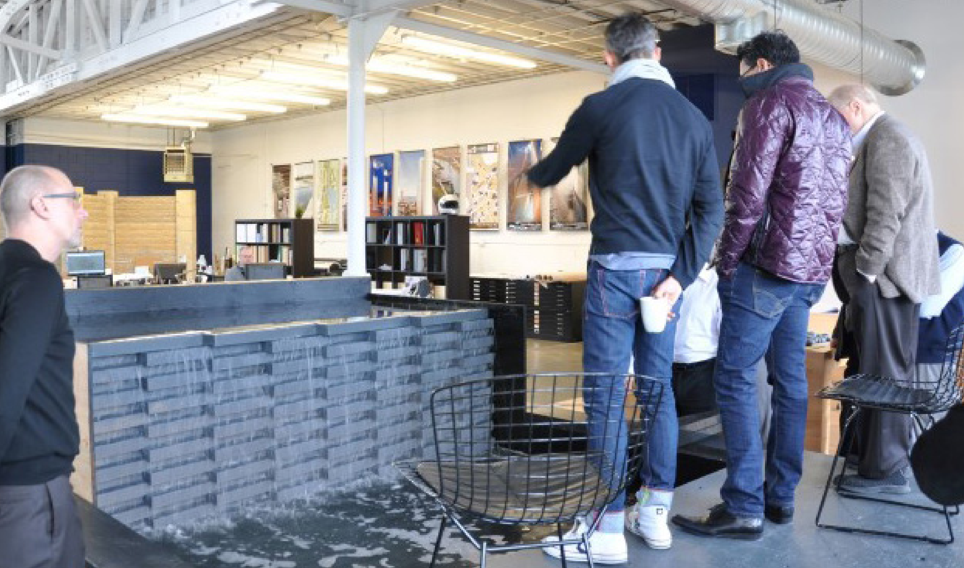
Full-scale Modeling: The 200-foot long water wall feature was initially tested by producing a full-scale in-house mock-up to provide a physical representation of the final design.