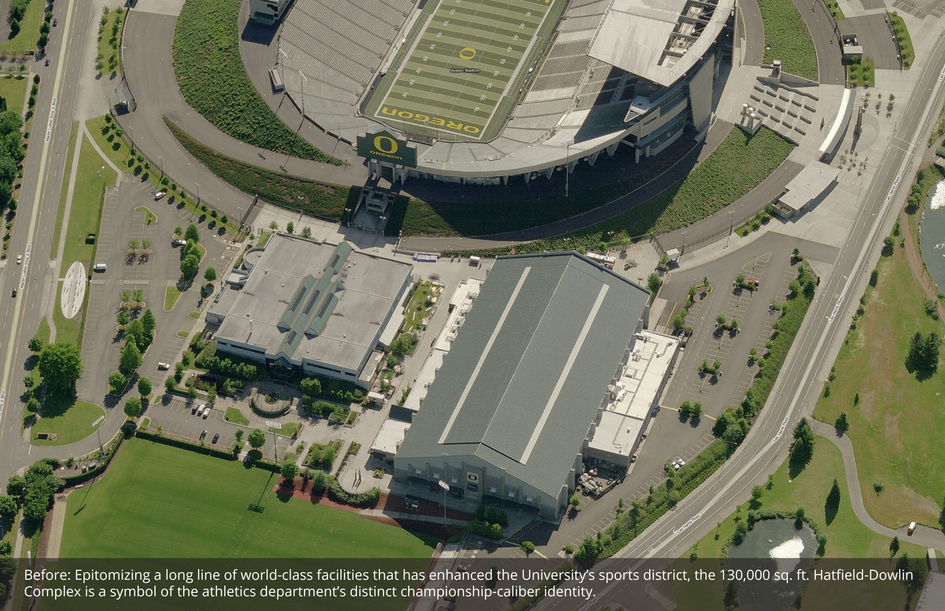
Before: Epitomizing a long line of world-class facilities that has enhanced the University's sports district, the 130,000 sq. ft. Hatfield-Dowlin Complex is a symbol of the athletics department's distinct championship-caliber identity.