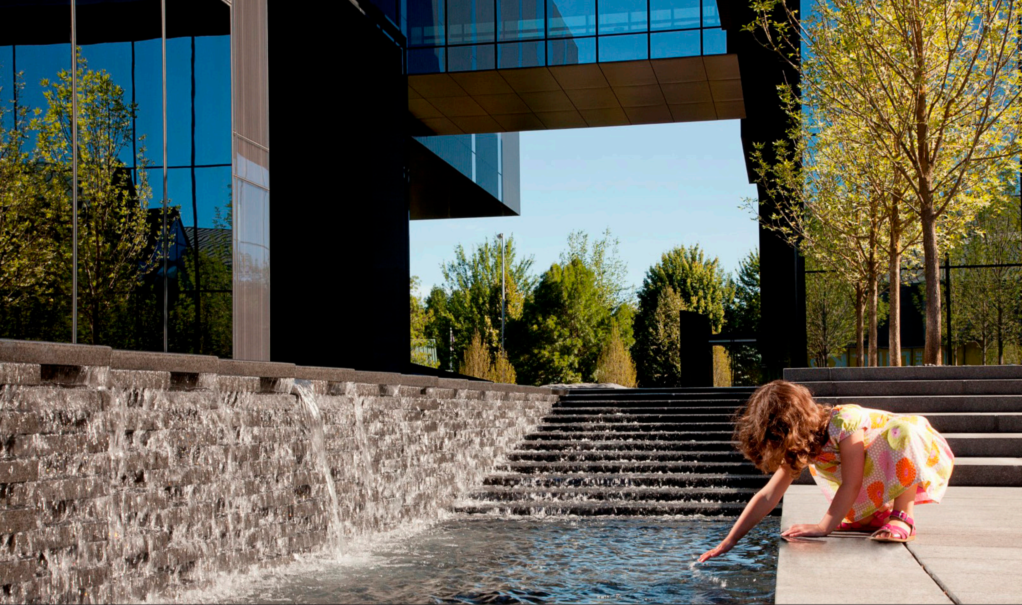
World-class: The artful integration of site, sports fields, architecture, and campus systems provides a landmark that exemplifies the University's long-term commitment to sustainability by exceeding the State Energy Efficiency Design requirements.