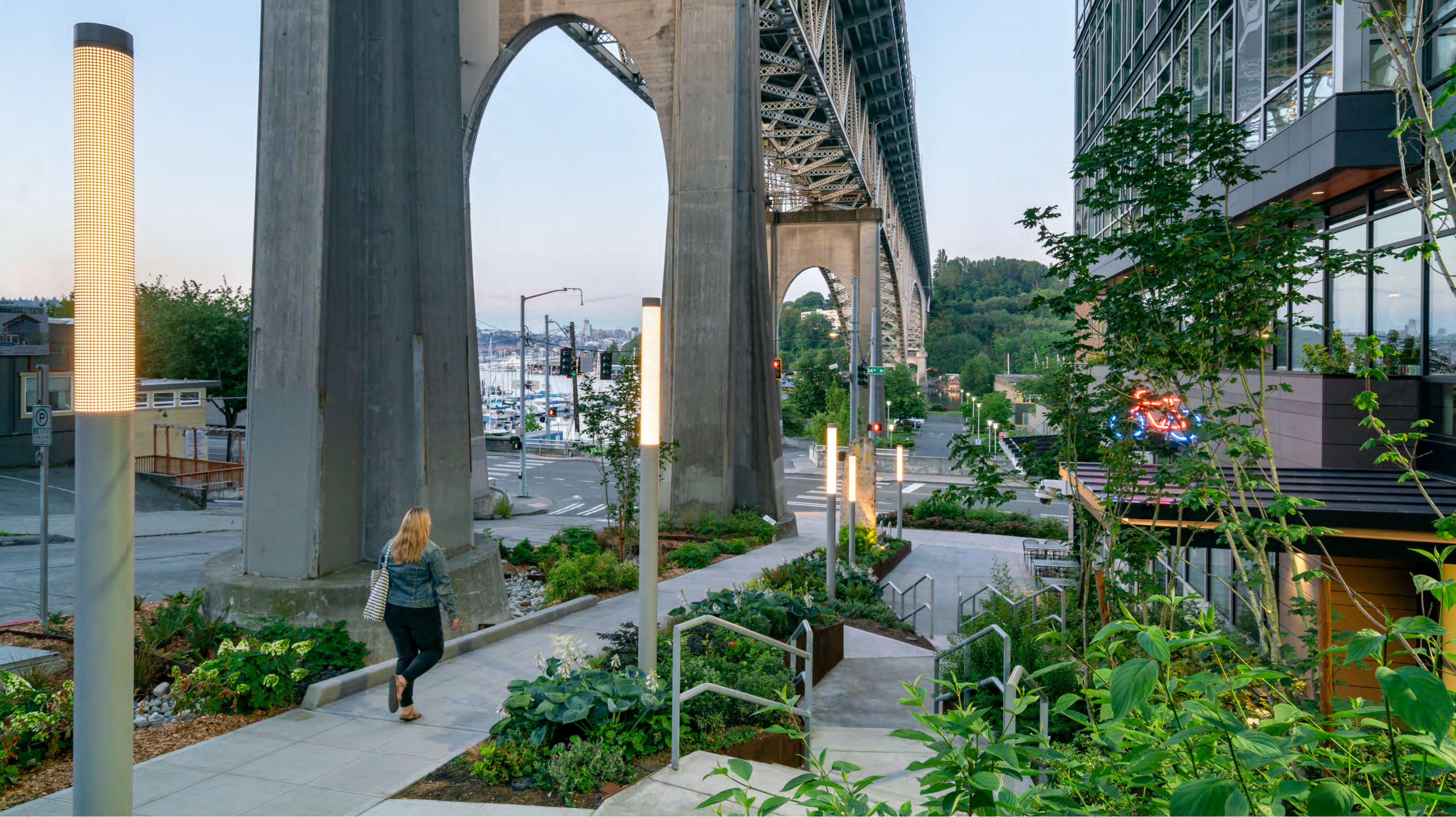
The bioretention planters are designed to flow between the Aurora Bridge columns and buffer the pedestrian pathway from the street. In addition, pedestrian scale lighting provides a safe route under the bridge.