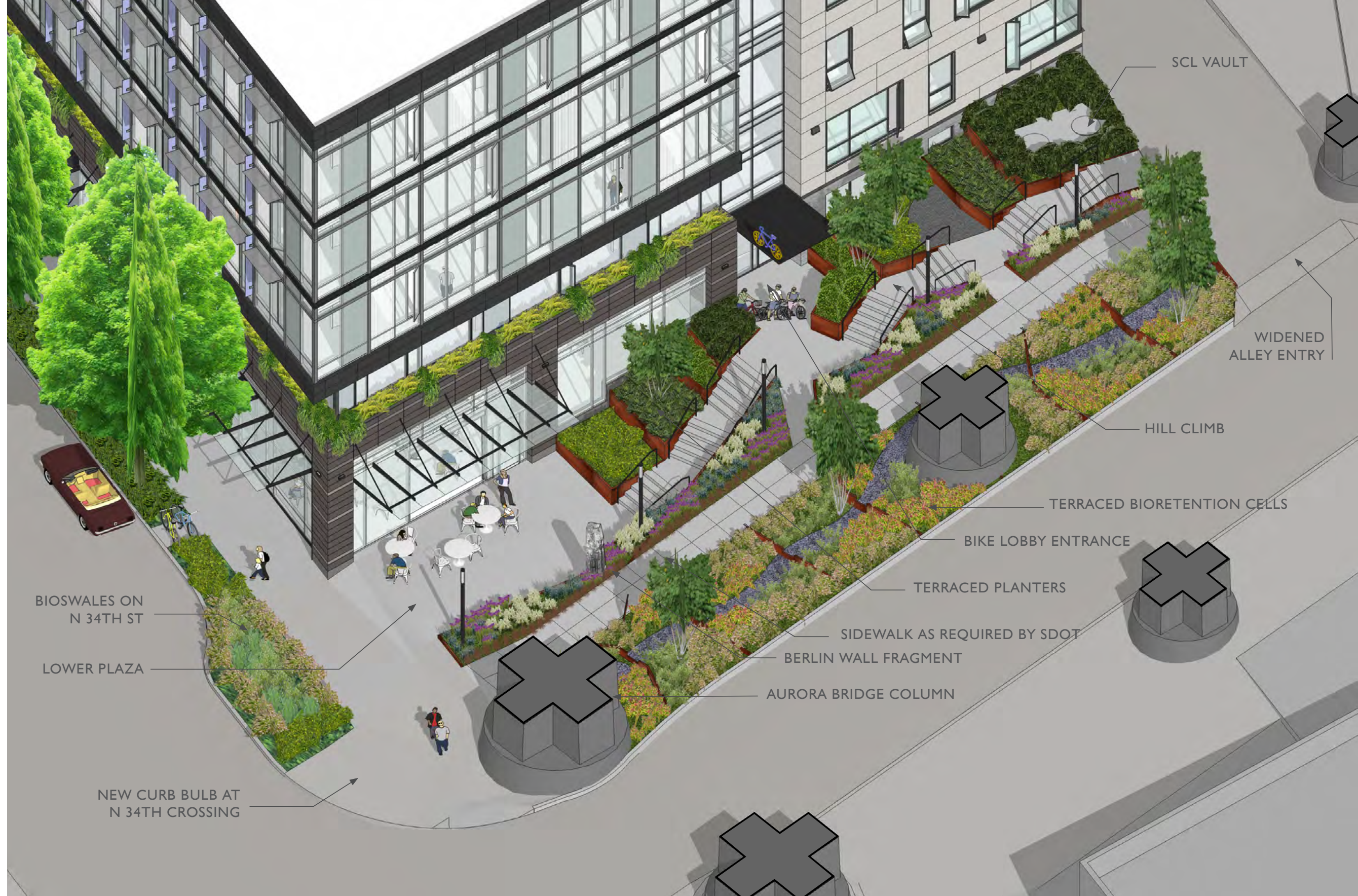
AXONOMIC VIEW OF TROLL AVENUE R.O.W.

Troll Avenue boasts 21 feet of grade change. Two pedestrian routes were designed to accommodate this. One, a typical pedestrian path along the building. The second to provide a stepped hill climb and access to each level of the building.