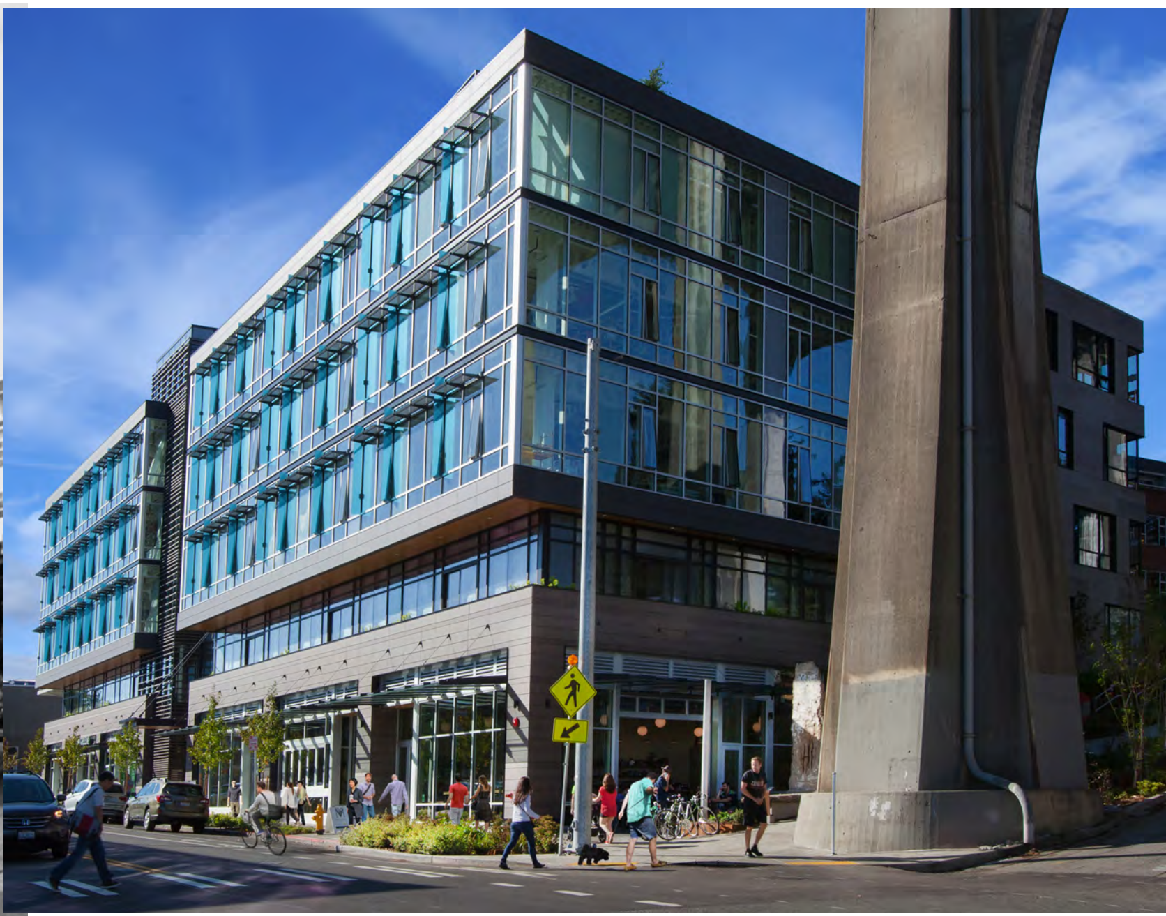
The streetscape next to DATA 1 was an unwelcoming place beneath the Aurora Bridge. In the rain, downspouts from the bridge splashed toxic runoff onto Troll Avenue, where it flowed directly into Lake Union, a spawning route for local salmon.