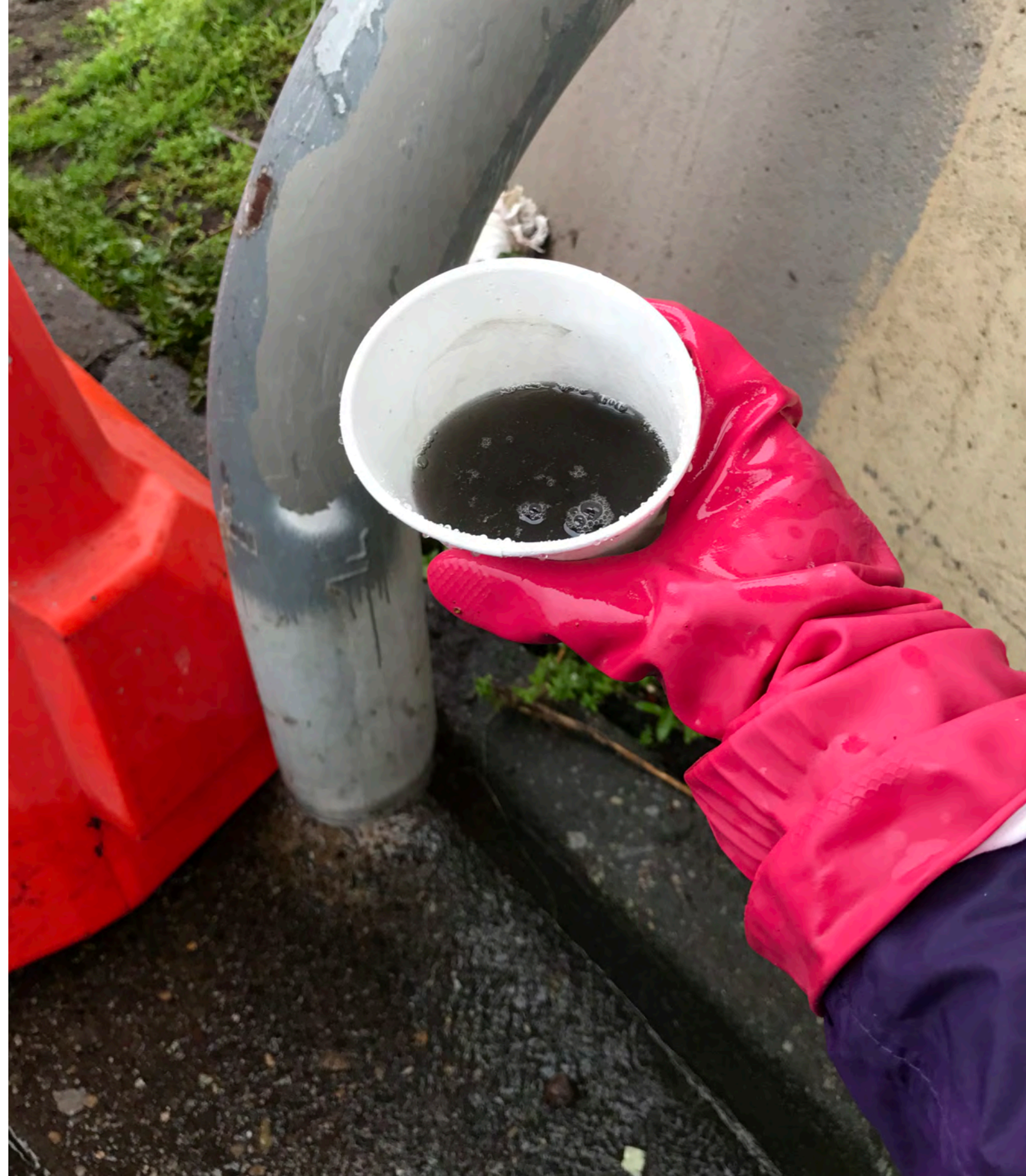
The Aurora Bridge, a state highway, sits over Troll Avenue. Originally, downspouts with toxic runoff from the Bridge were led directly onto the street and down into Lake Union, a major spawning route for the region's Salmon.