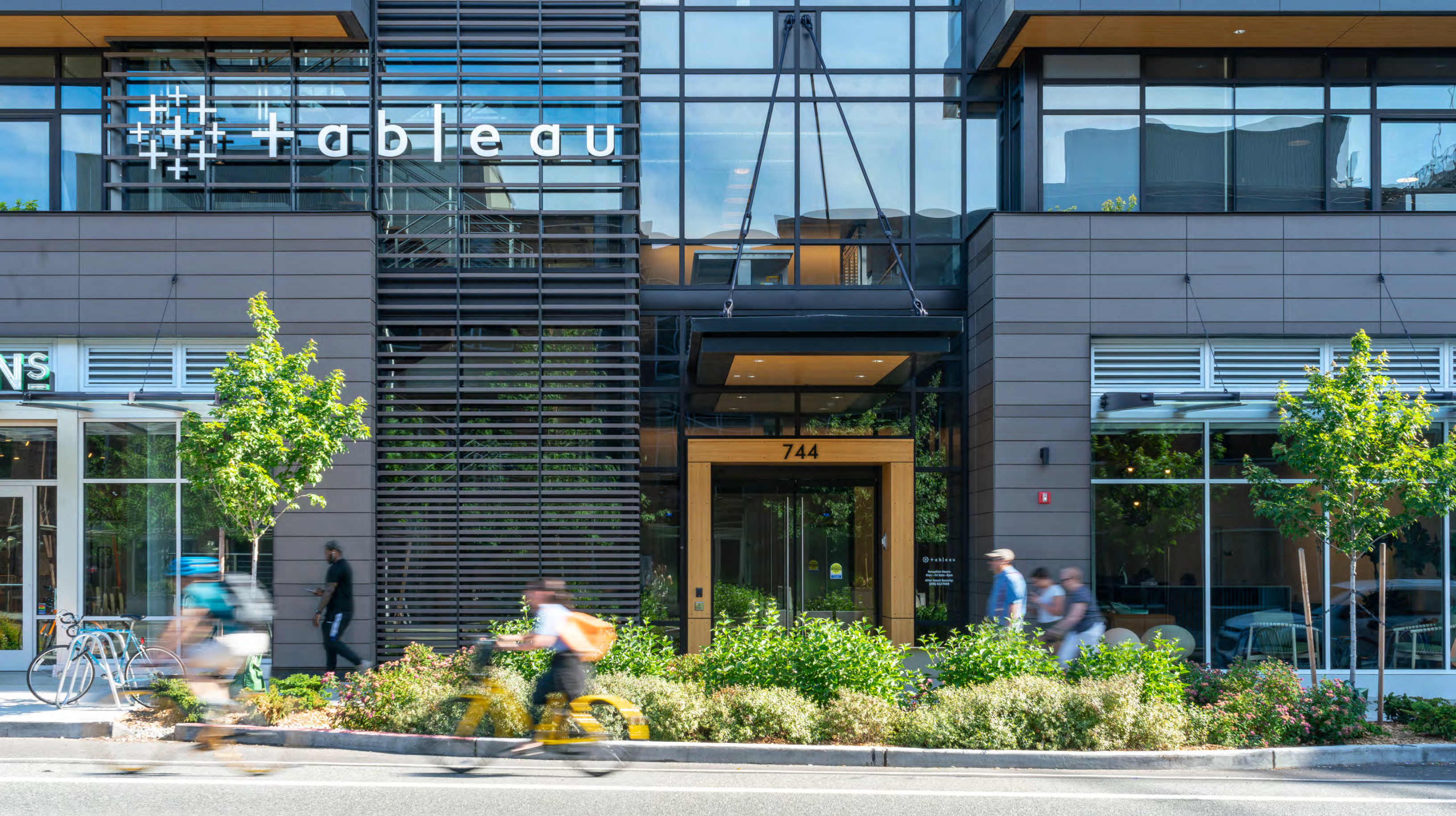
The main entrance to the building off of 34th Street is protected from nearby traffic and an active bike lane with an extended curb bulb that boasts lush streetscape plantings continually displaying seasonal color.