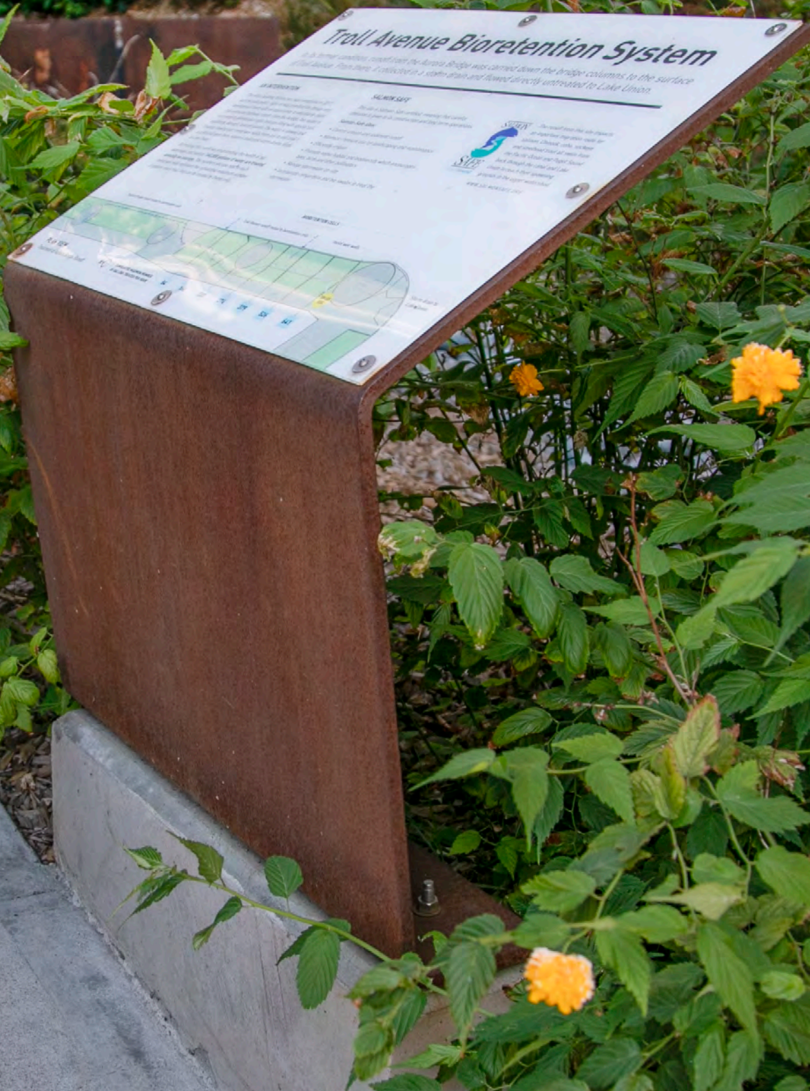
As part of the integrated design process, the neighborhood requested educational signage detailing how the 160,000 gallons of stormwater runoff are treated annually on site.