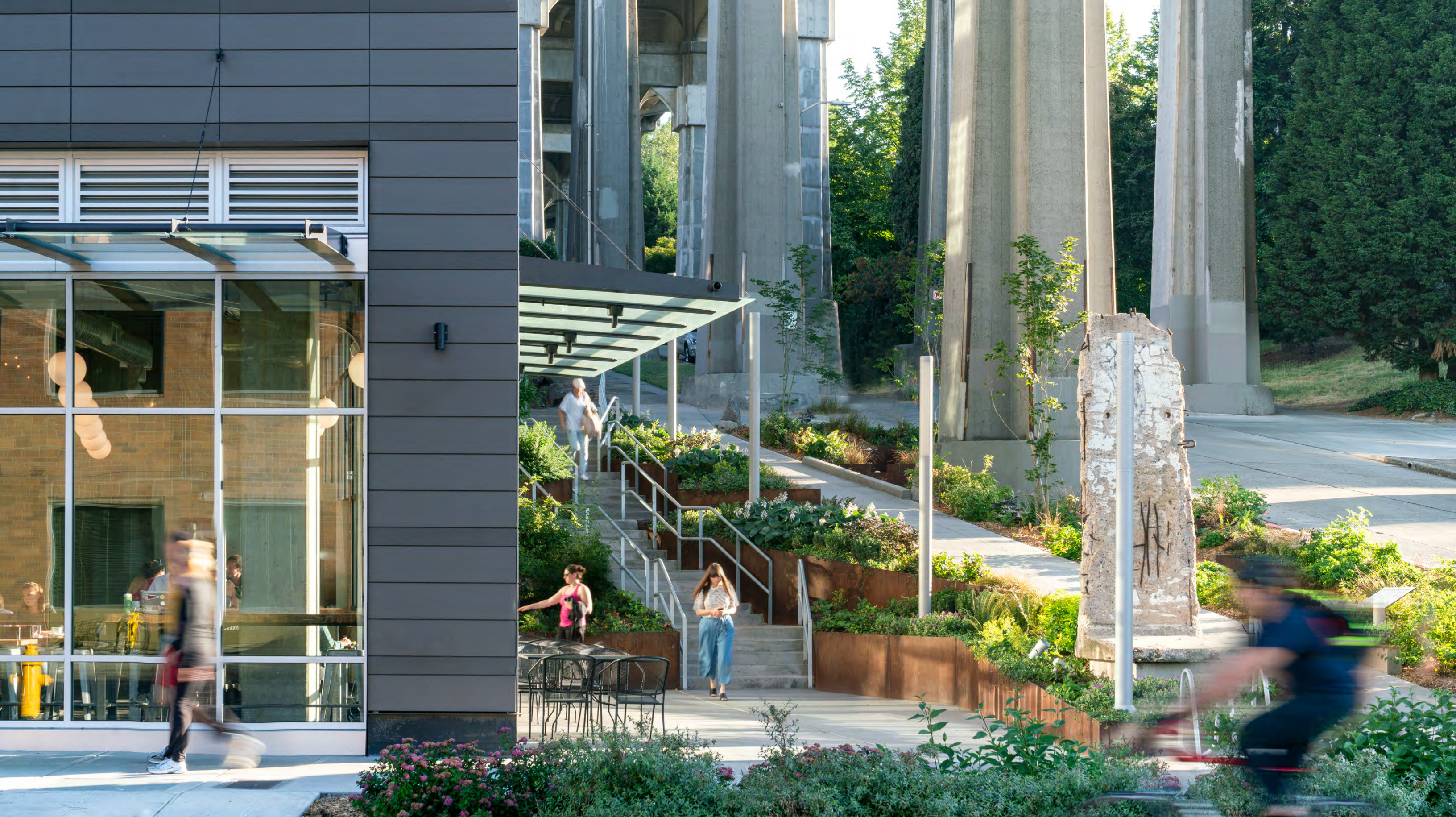
Along the hill climb, tiered planters are used to soften the pedestrian experience. The materiality of the hill climb harkens back to the industrial past of the neighborhood with weathering steel walls, concrete and steel walkways, and a piece of the Berlin Wall.