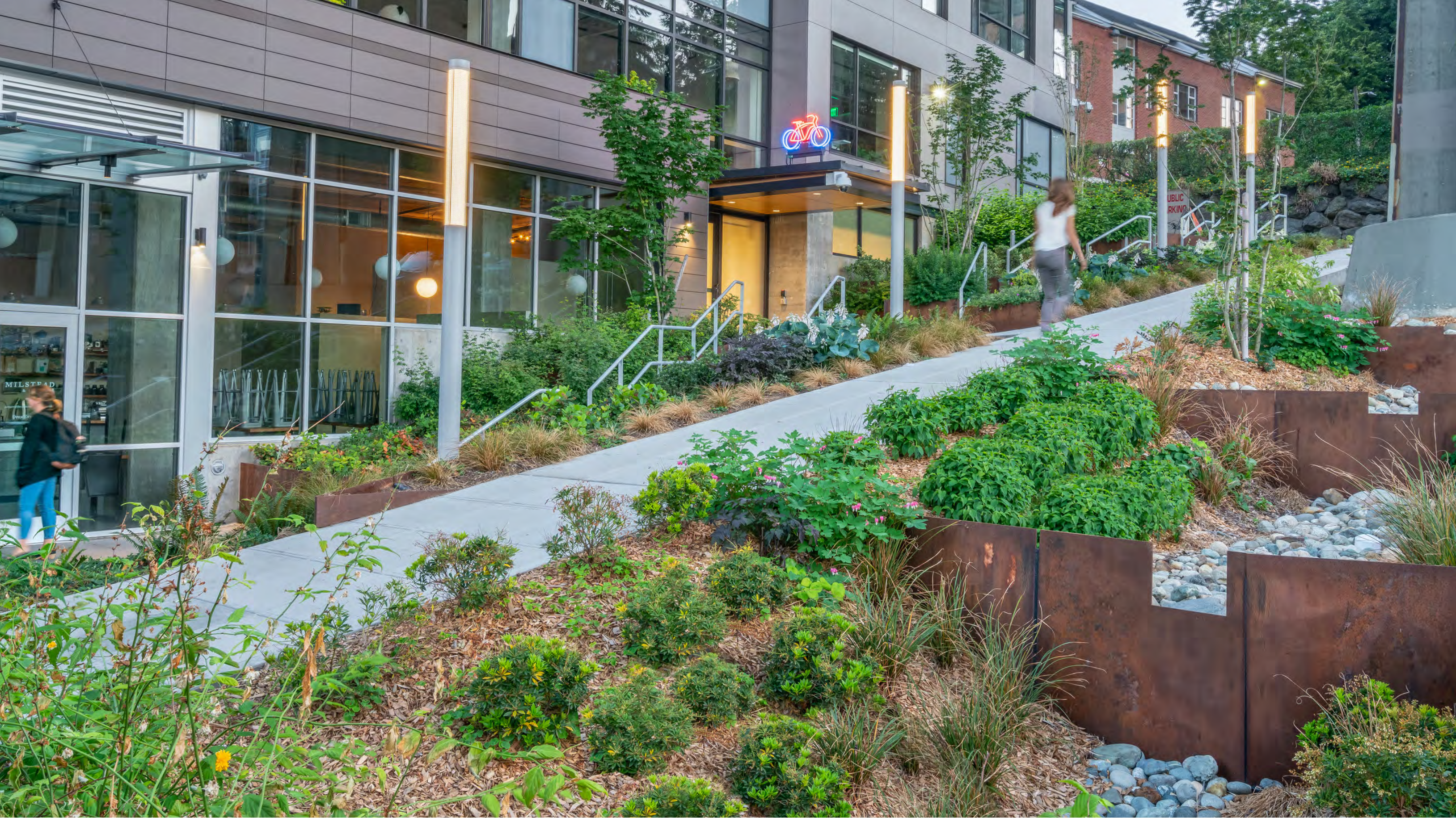
This run-off has been re-routed to flow through a series of stepped bioretention planters adjacent to the pedestrian pathway where it now slows the stormwater runoff and cleans the toxic water before flowing into Lake Union.