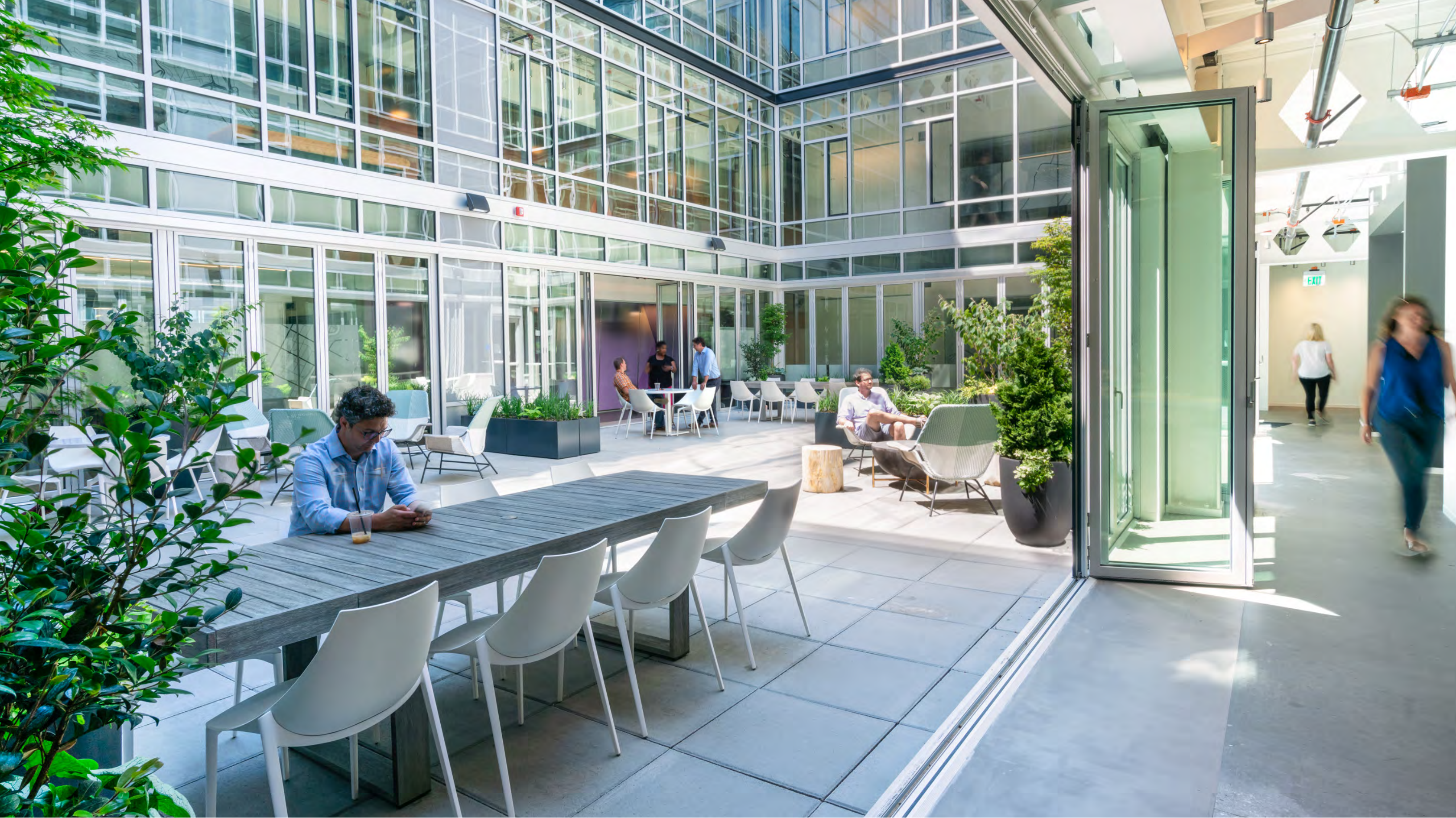
To realize the tenant's goal of supporting healthy lifestyles of its employees, an interior open-air courtyard was designed to provide access to light, air and views to all of the employees within the building.