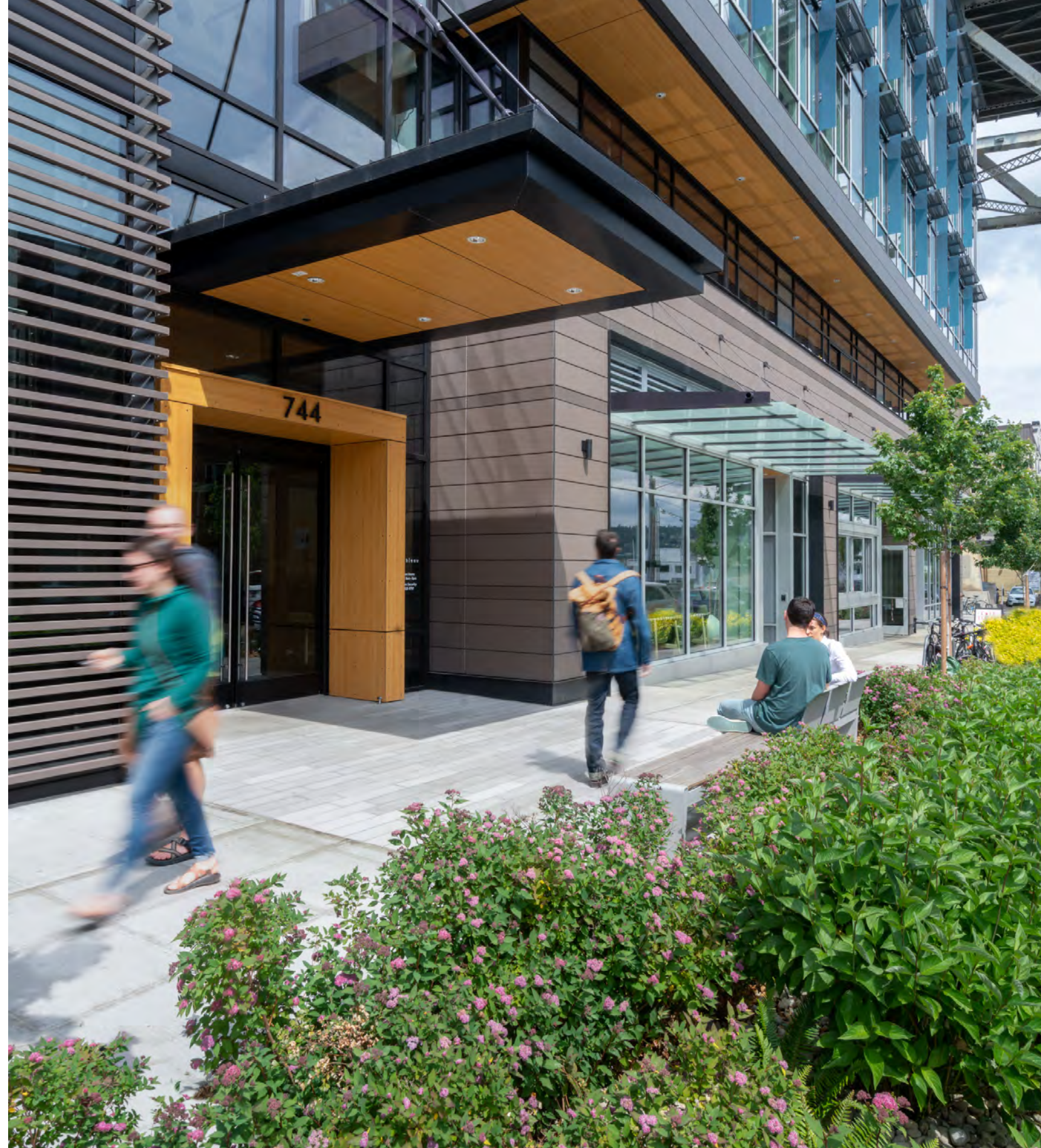
The entrance is distinguished from the pedestrian pathway with accented paving using changes in color, module size, and texture. Across from the entrance, pedestrian seating is cushioned in the lush planting provides respite for the passersby.