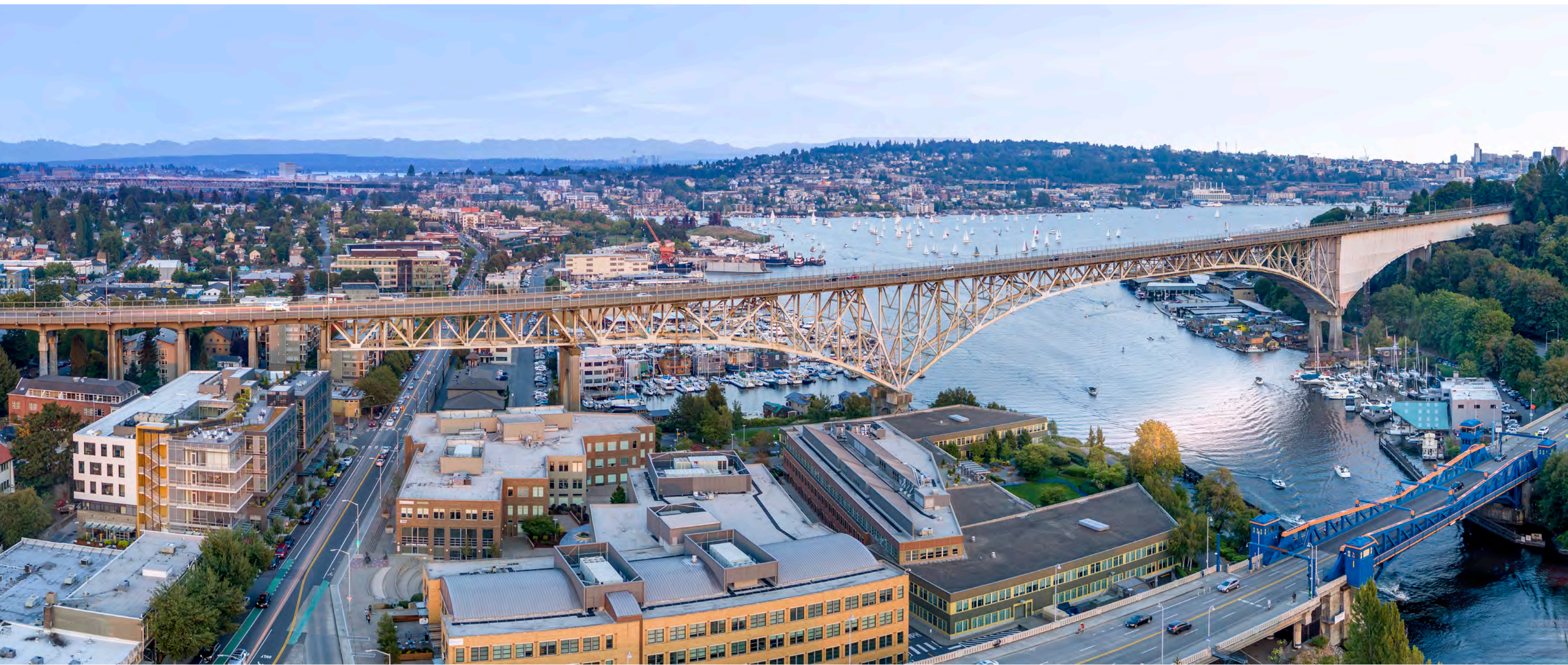
Aerial view of DATA 1 (bottom left) looking east across Lake Union