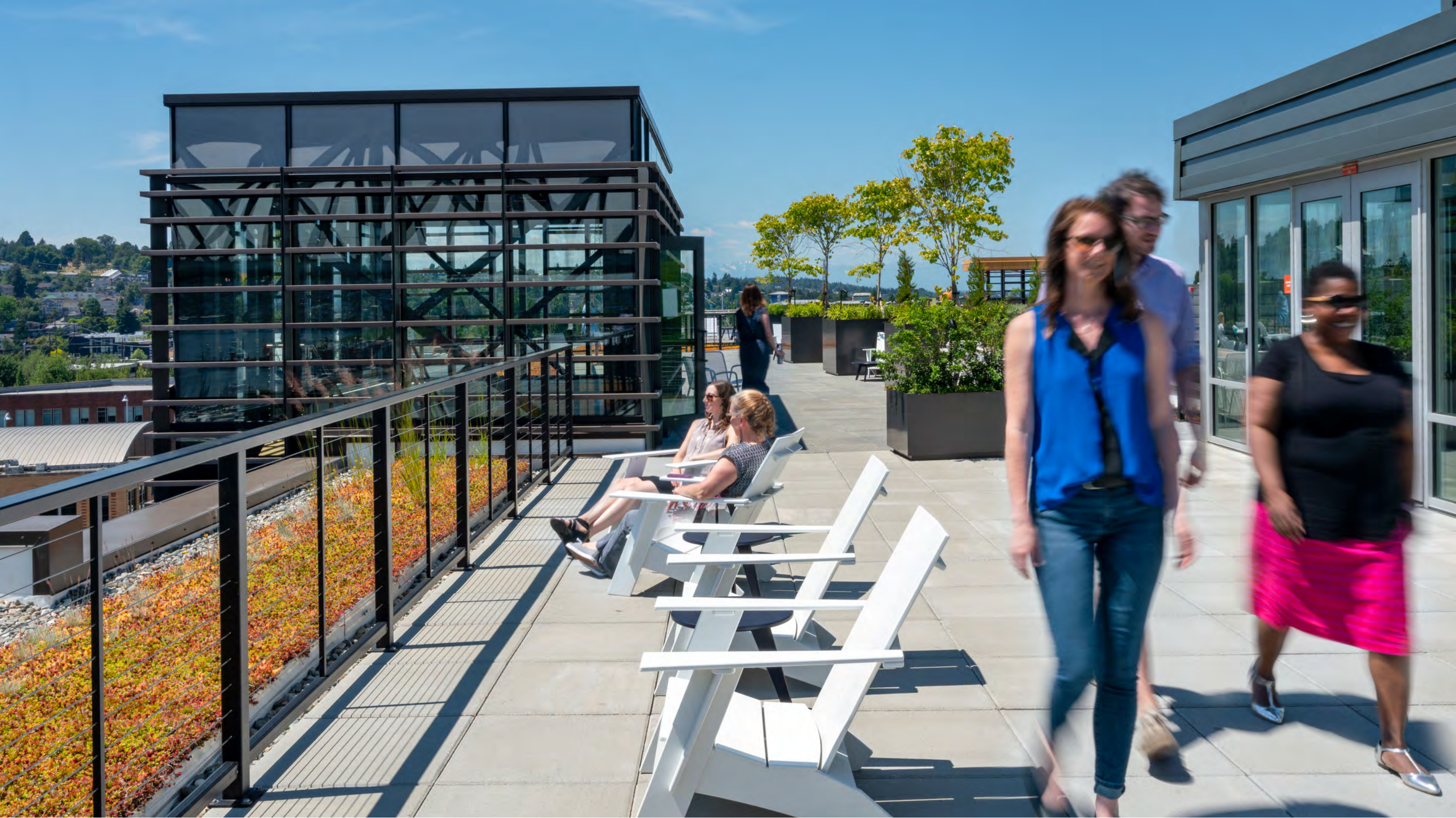
The rooftop deck provides exceptional views of the Aurora Bridge, Mt. Rainier and Lake Union giving the employees a space for respite during the day. Access to the outdoor environment promotes both increased productivity and satisfaction of the employees.