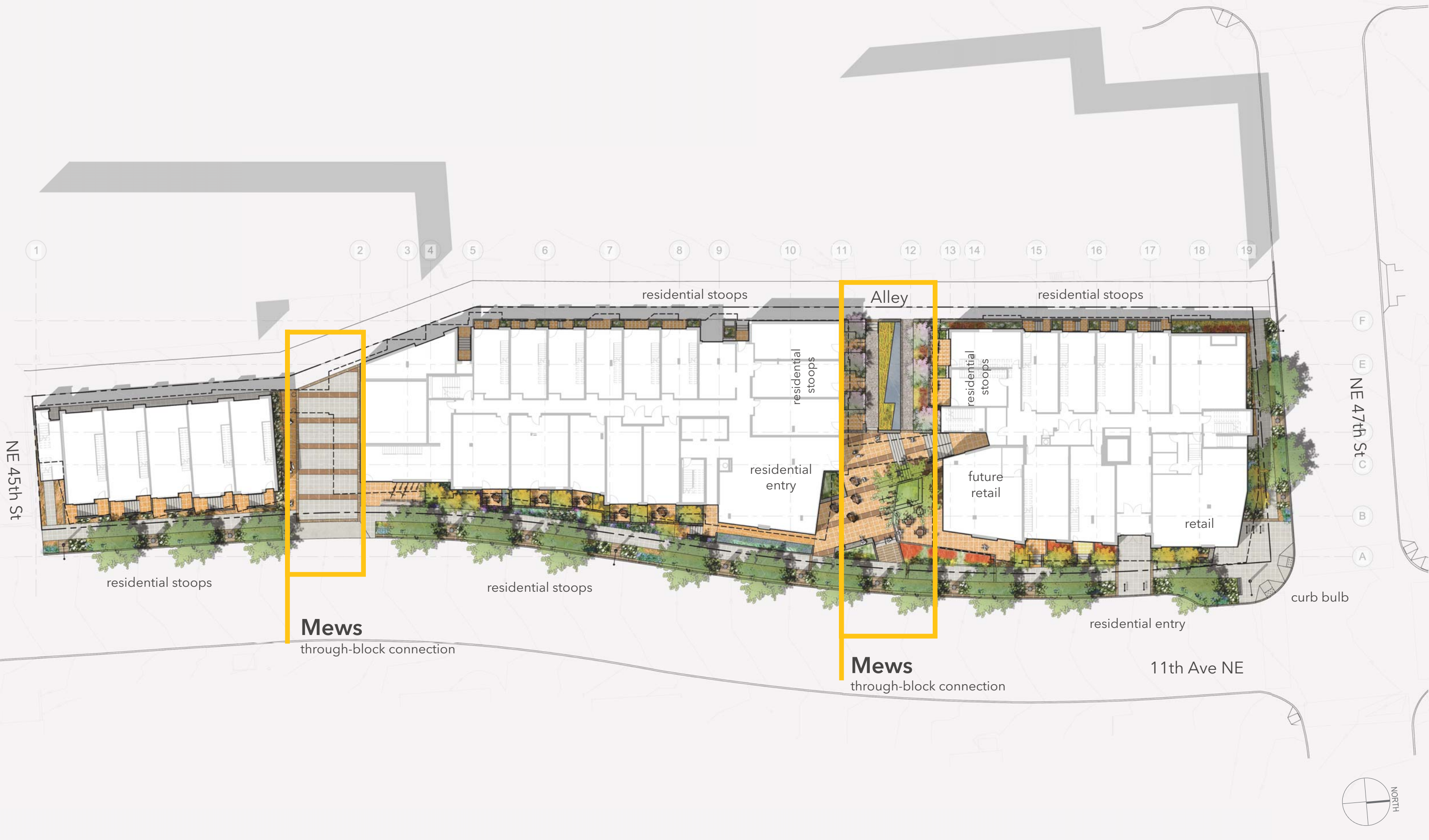
Public Realm Site Plan demonstrating the narrow, long block and urban design response of breaking the block into three buildings for permeability, pedestrian scale and contextual fit with the neighborhood.