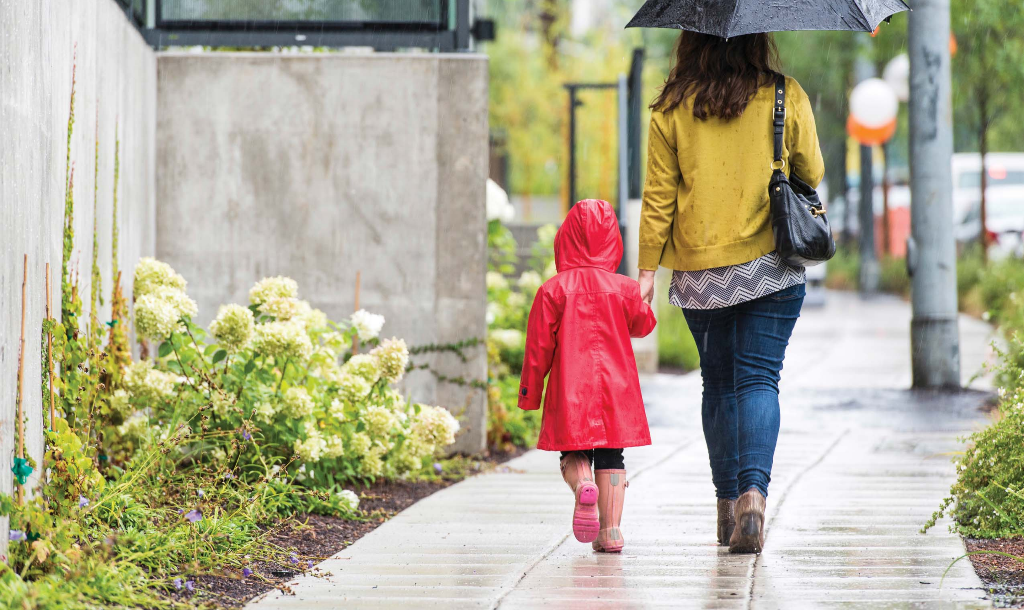
The project is a catalyst for an emerging urban neighborhood with a streetscape that sets a standard of quality for subsequent development to follow.