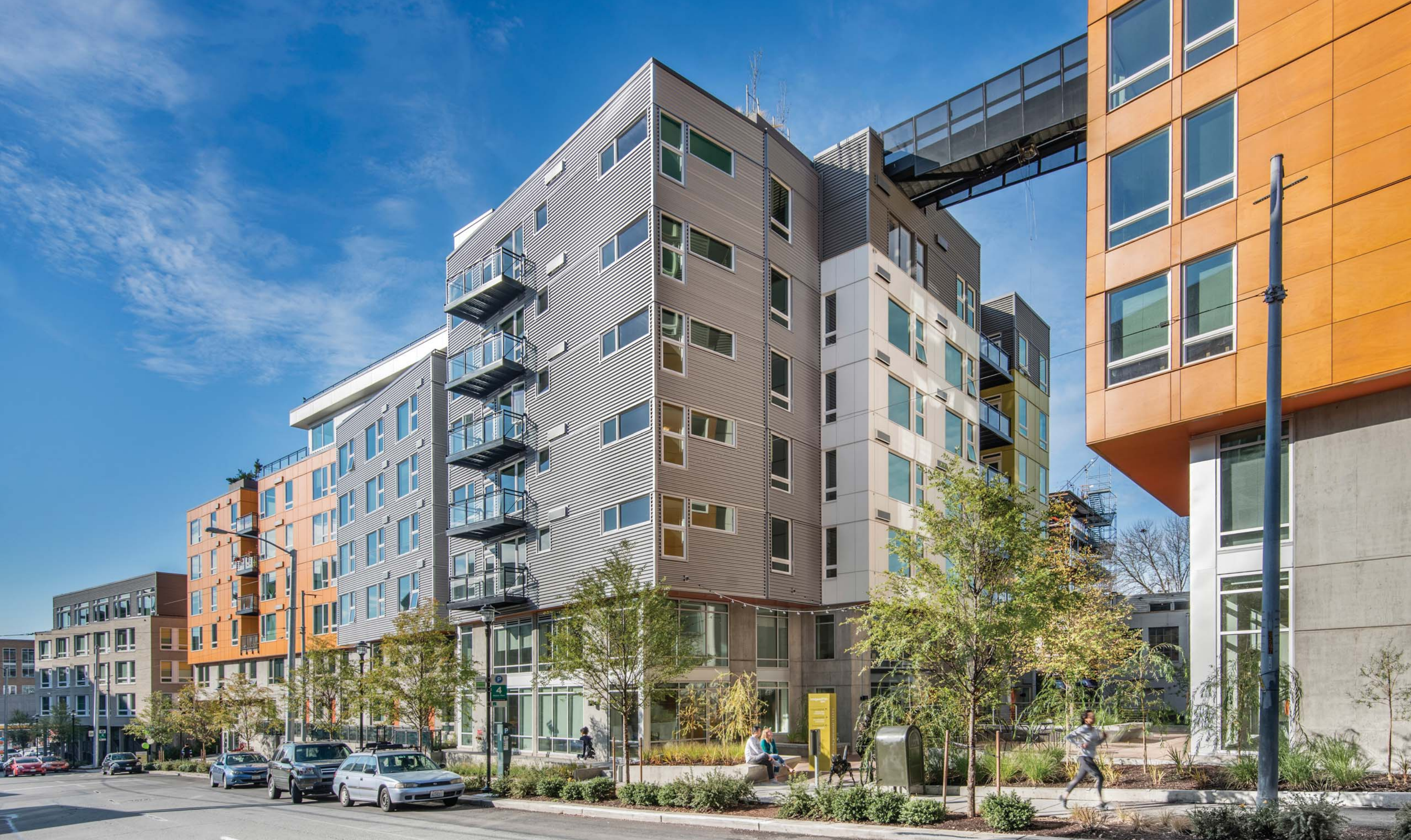
Street view of publicly accessible ground level open spaces and streetscape with pedestrian and bike amenities – consistent rhythm of pedestrian-scale lighting, street trees, bike racks, bike fix-it station, building transparency and permeability.