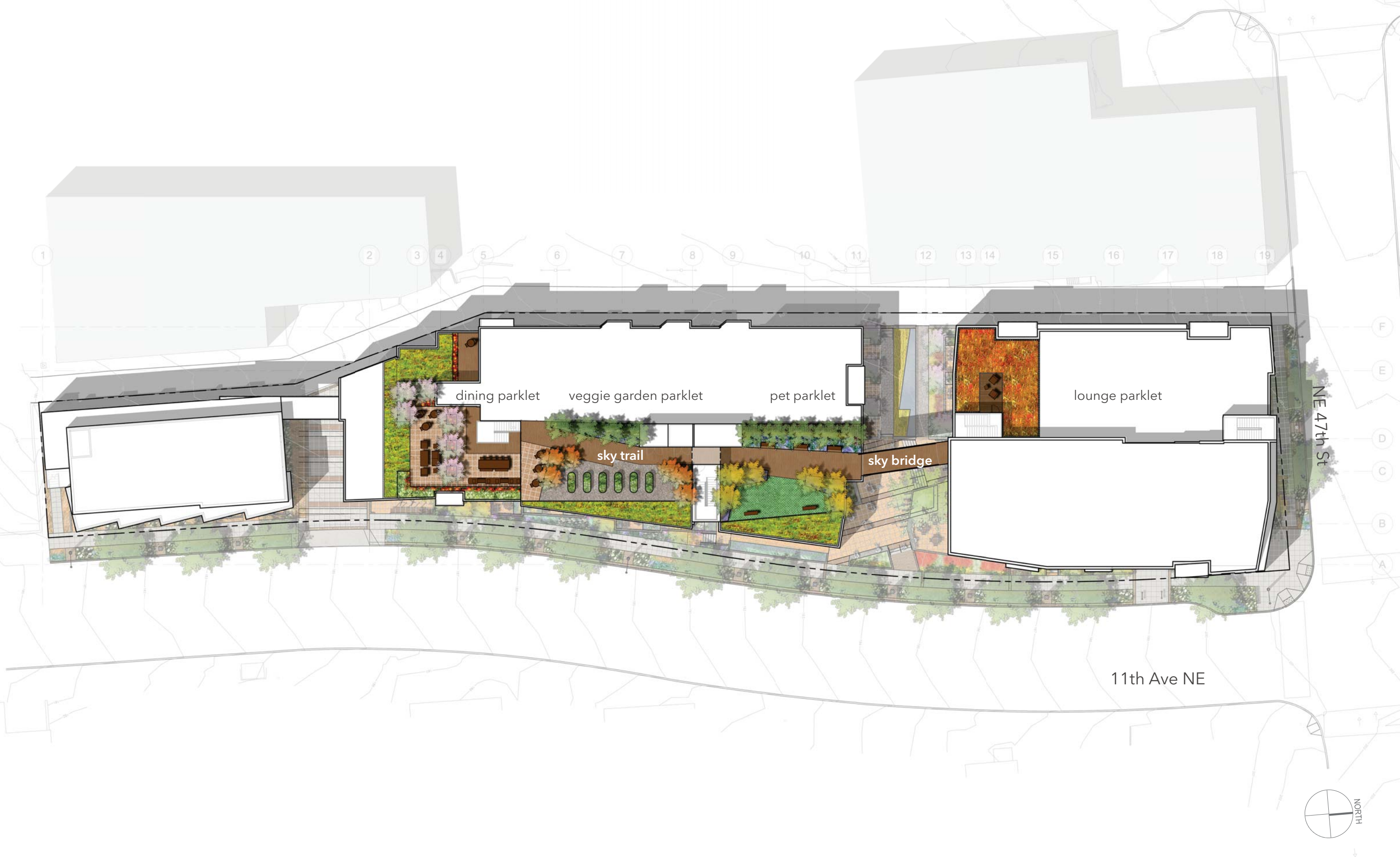
Urban sky trail and bridges link parklets to attract families and reduce sprawl to the suburbs. Parklets include an outdoor lounge, turf run for pets, veggie bins for urban gardening, and dining terraces for al fresco family dining.