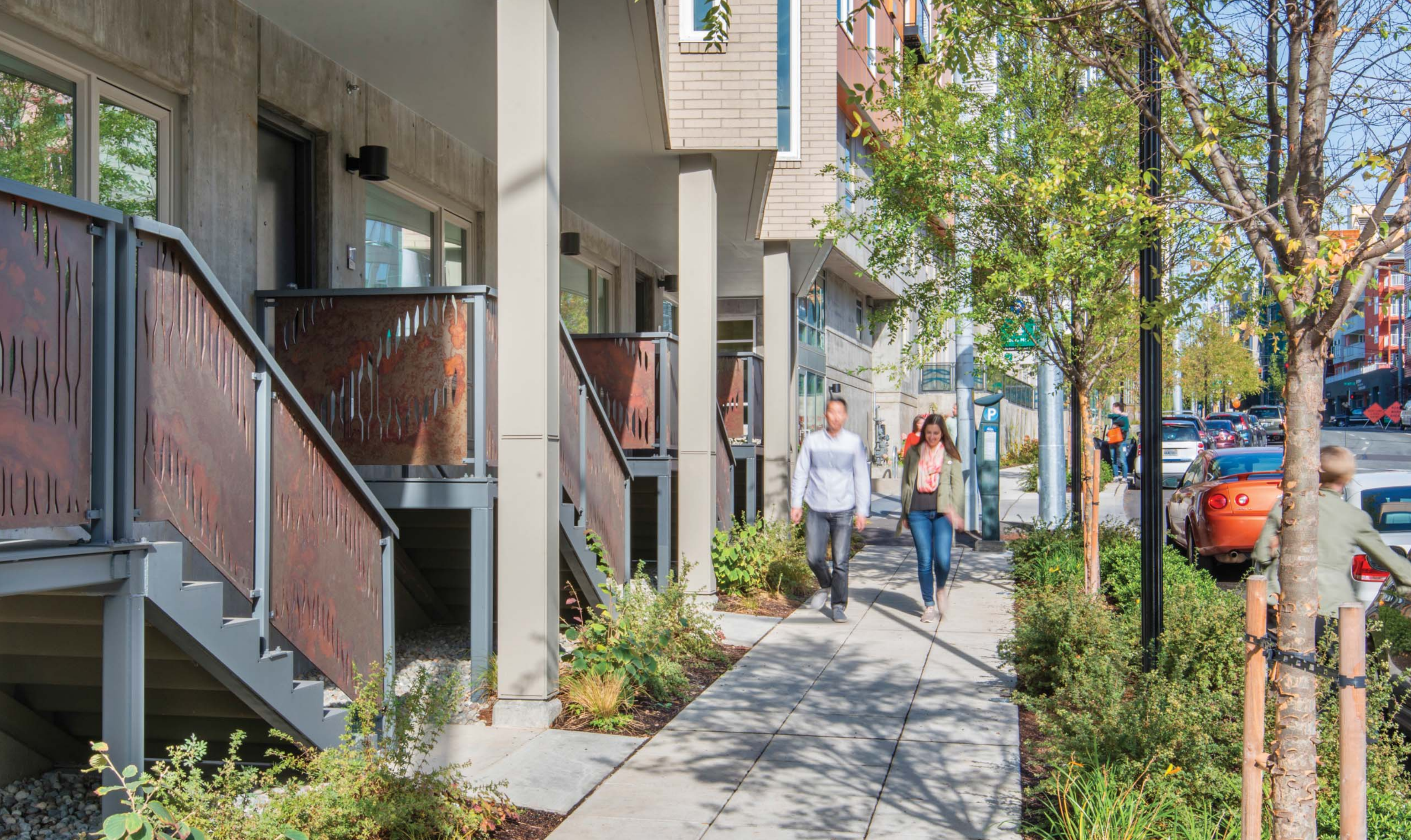
Residential stoops activate the streetscape, with artist designed steel panels and open stairs giving a nod to stormwater infiltrating soils and planting.