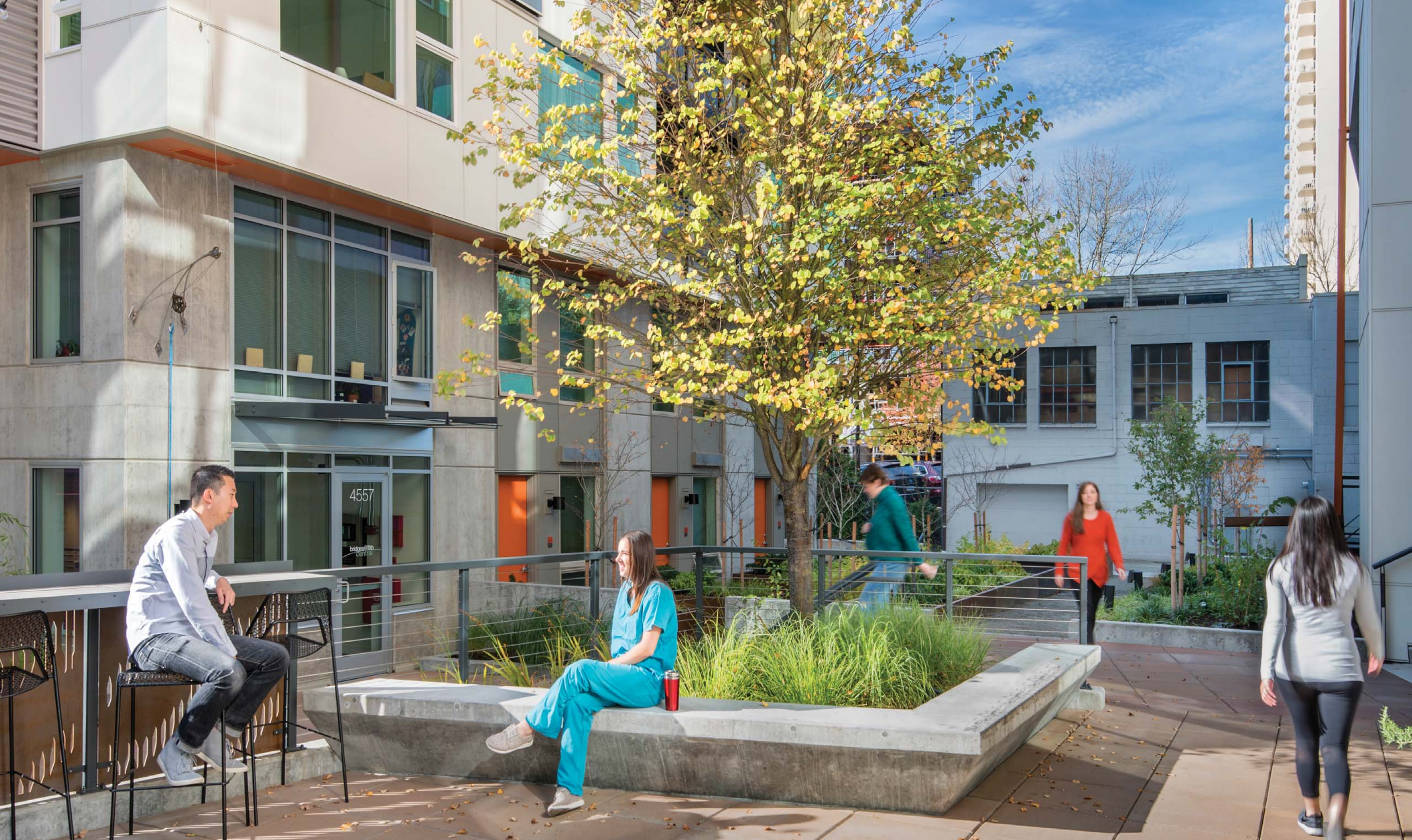
A diversity of seating including bar top, bistro tables and seat walls provide hang-out places for residents throughout the mews.