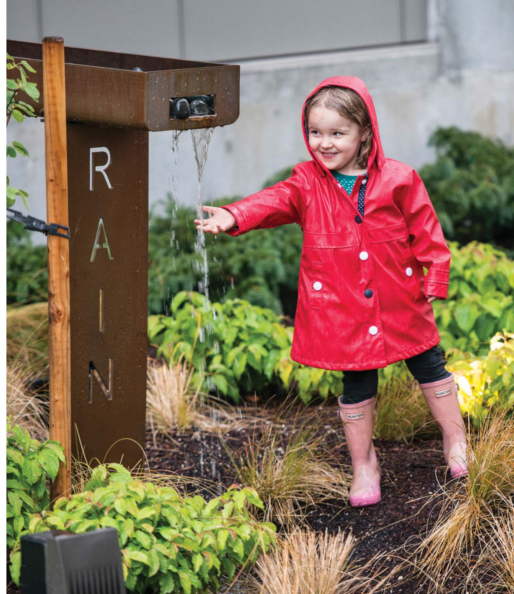
Embracing Seattle's climate, rain gardens bring residential character to the mews, infiltrate run-off from the roof, and provide a through block connection for the neighborhood to connect residents to nearby grocery stores, movie theaters, and yoga studios.