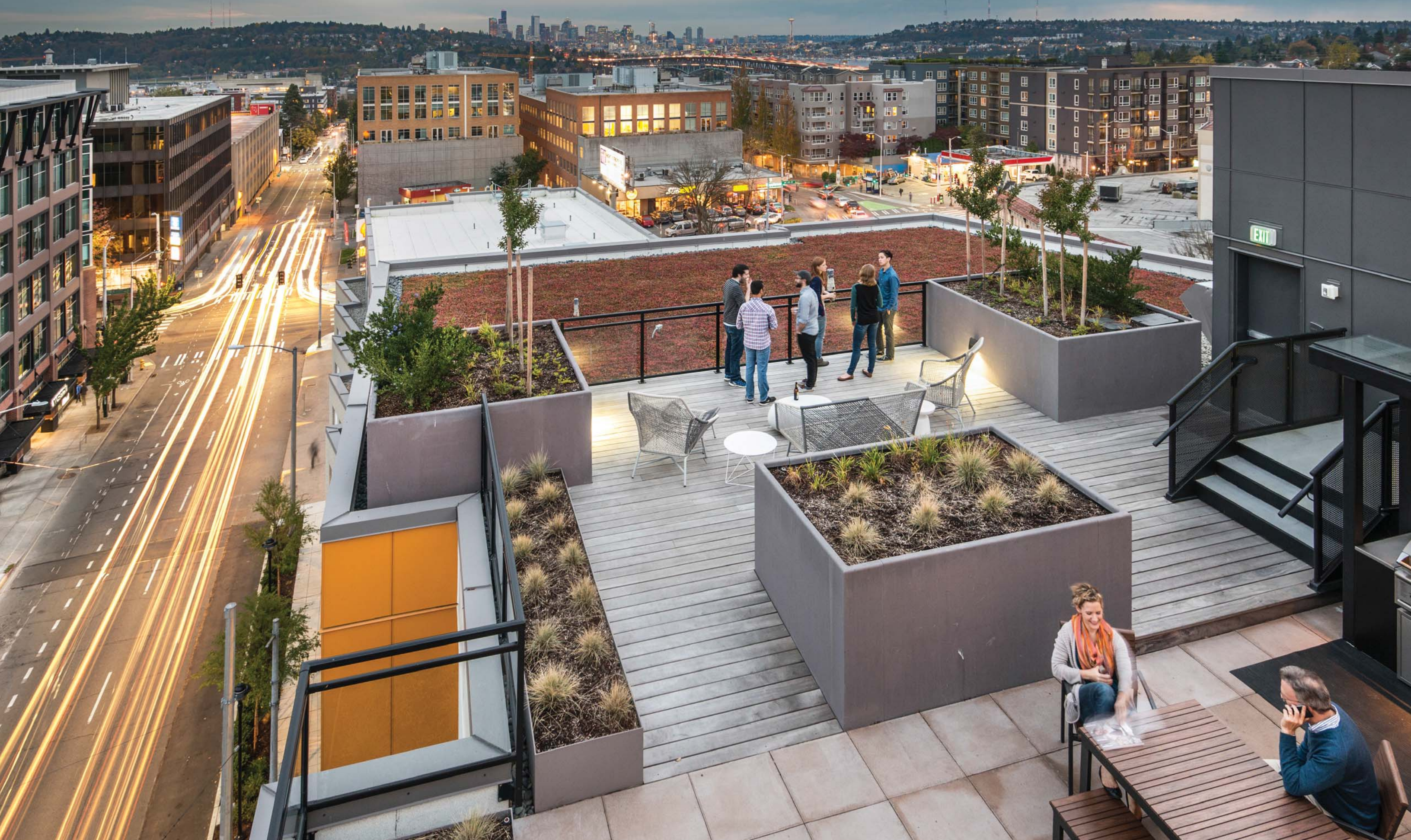
An integrated approach to design yielded open spaces that preserved the best views for common gathering spaces.