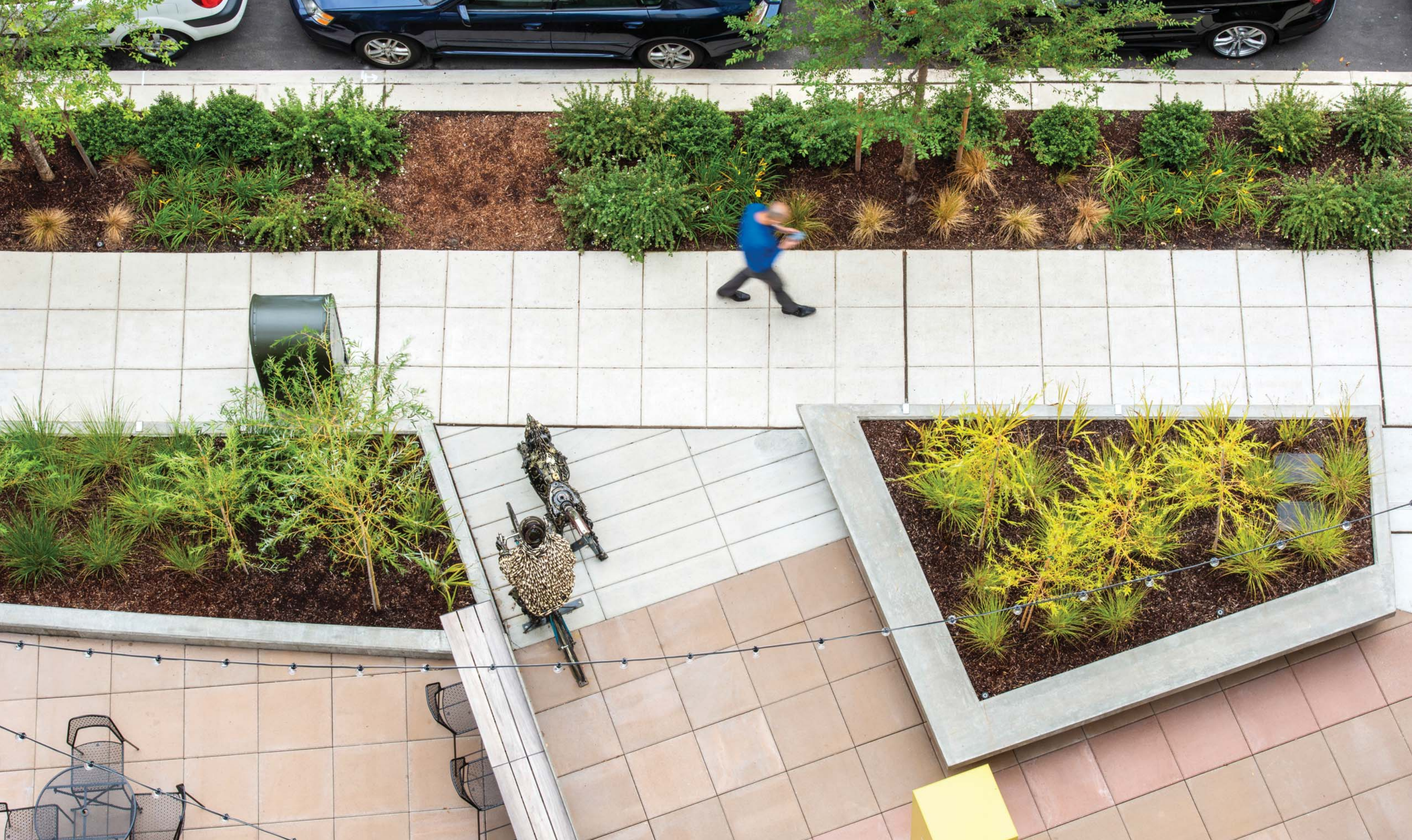
Publicly viewable art is woven throughout the project, giving a nod to the core components of everyday urban living – bikes, dogs, passage of time and a result of car-free culture: an innate, daily immersion in weather.