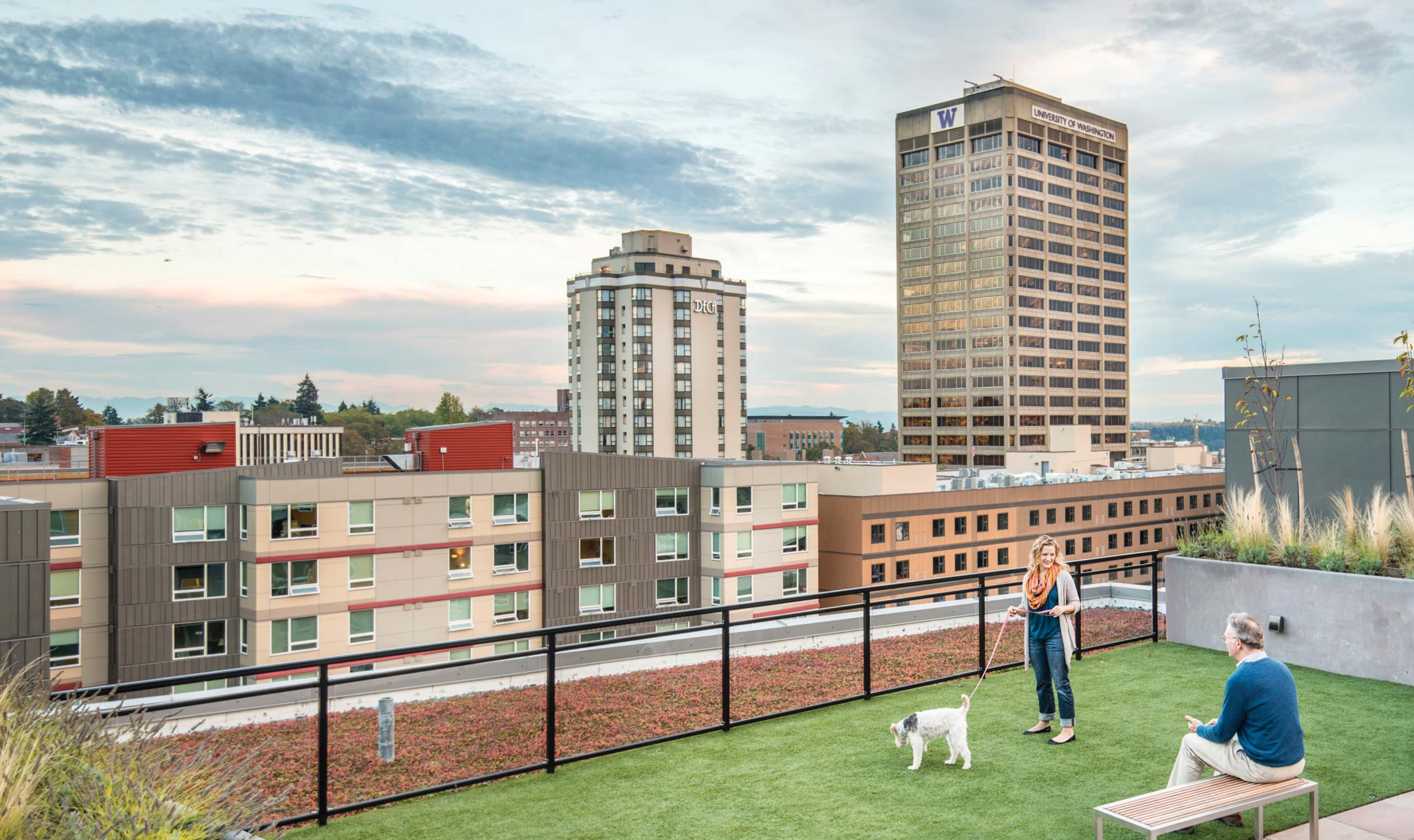
A place for the family dog, with every roof-level amenity space oriented to provide views to the surrounding neighborhood. As much attention went into a direct, clear, comfortable connecting 'trail' as into the amenity spaces themselves.