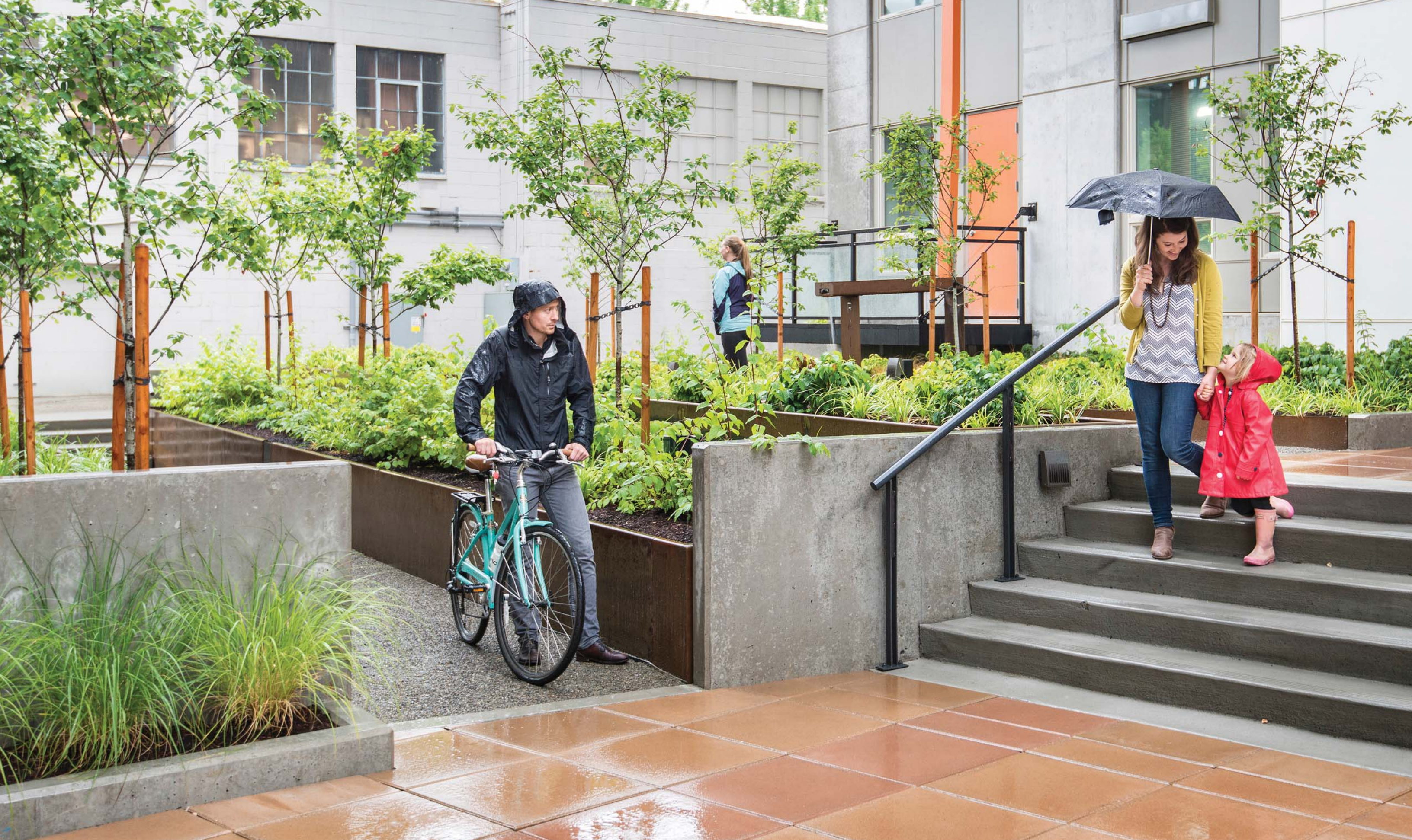
A network of accessible paths, stairs, sidewalks and plazas connect residents to each other, nature, and a diversity of amenities both within the buildings and in the neighborhood.