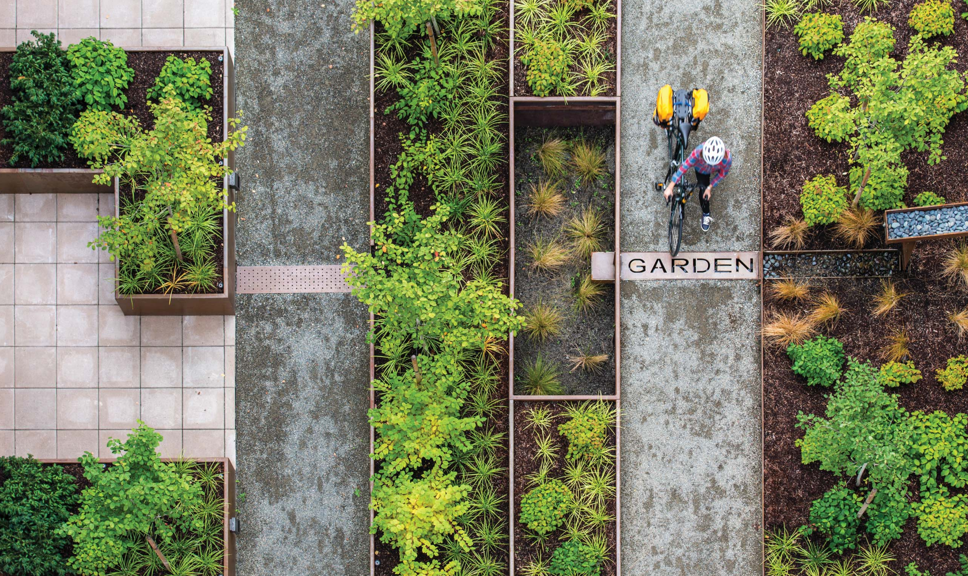
Approachable, texture-rich materials include crushed rock, weathered steel, concrete, native and adaptive planting in an intentionally warmer and brighter palette.