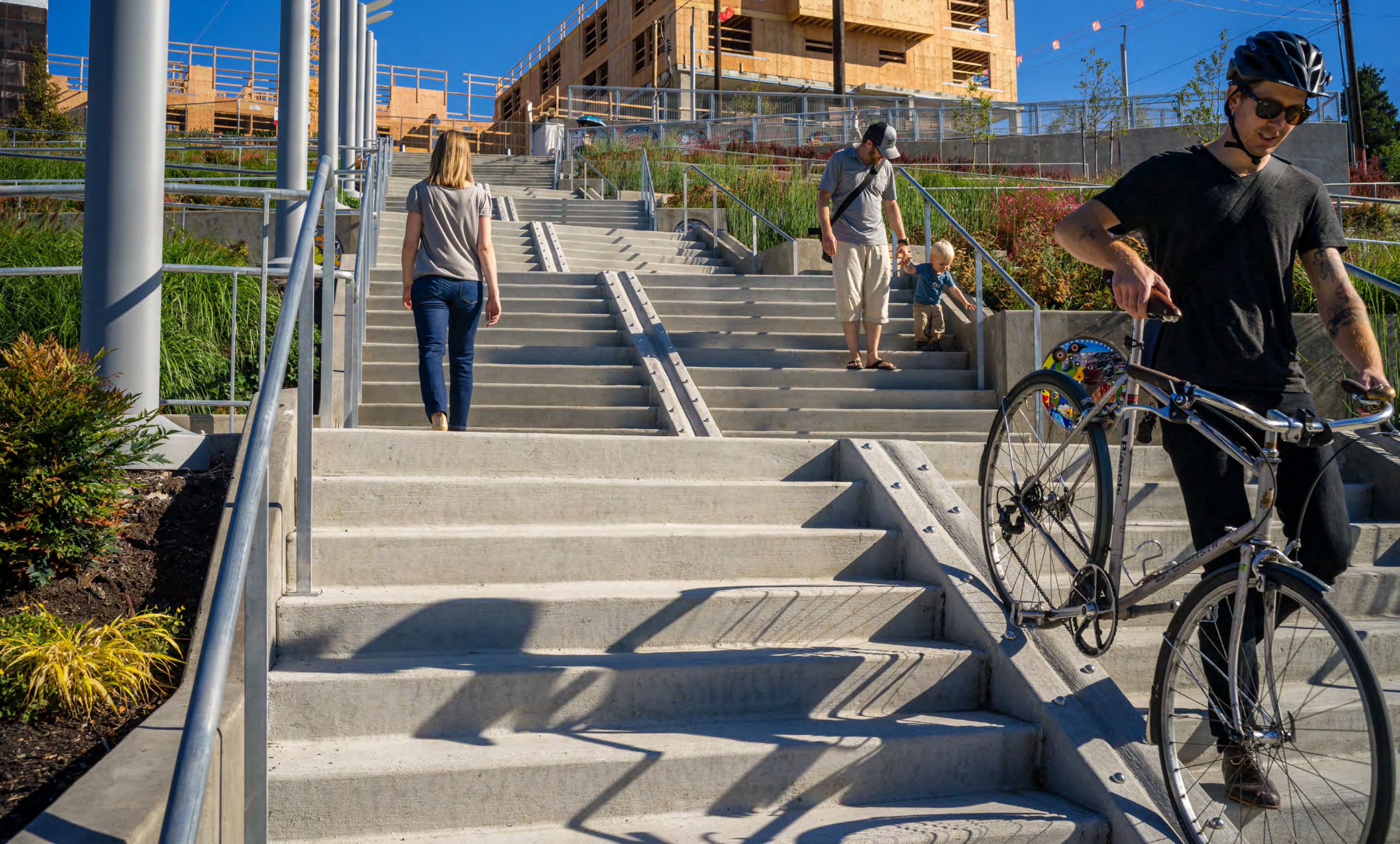
A view from the bottom of the Hill Climb looking north and up, with the stairs and bike runnel.