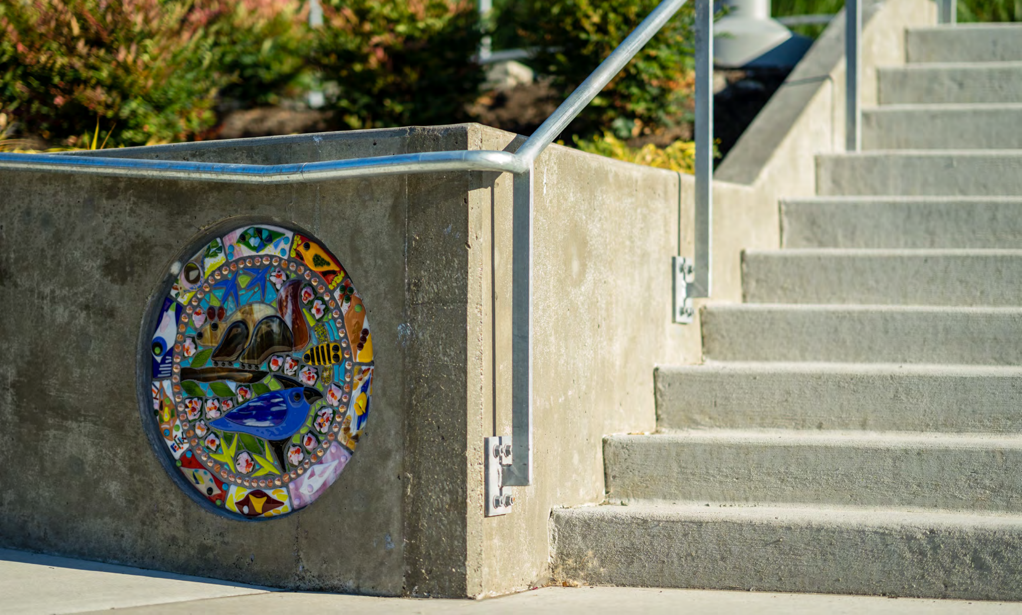
Glass Art Medallions inserted in walls accompany the walker on the climb. The medallions represent Yesler Terrace's culture—past, present and future.