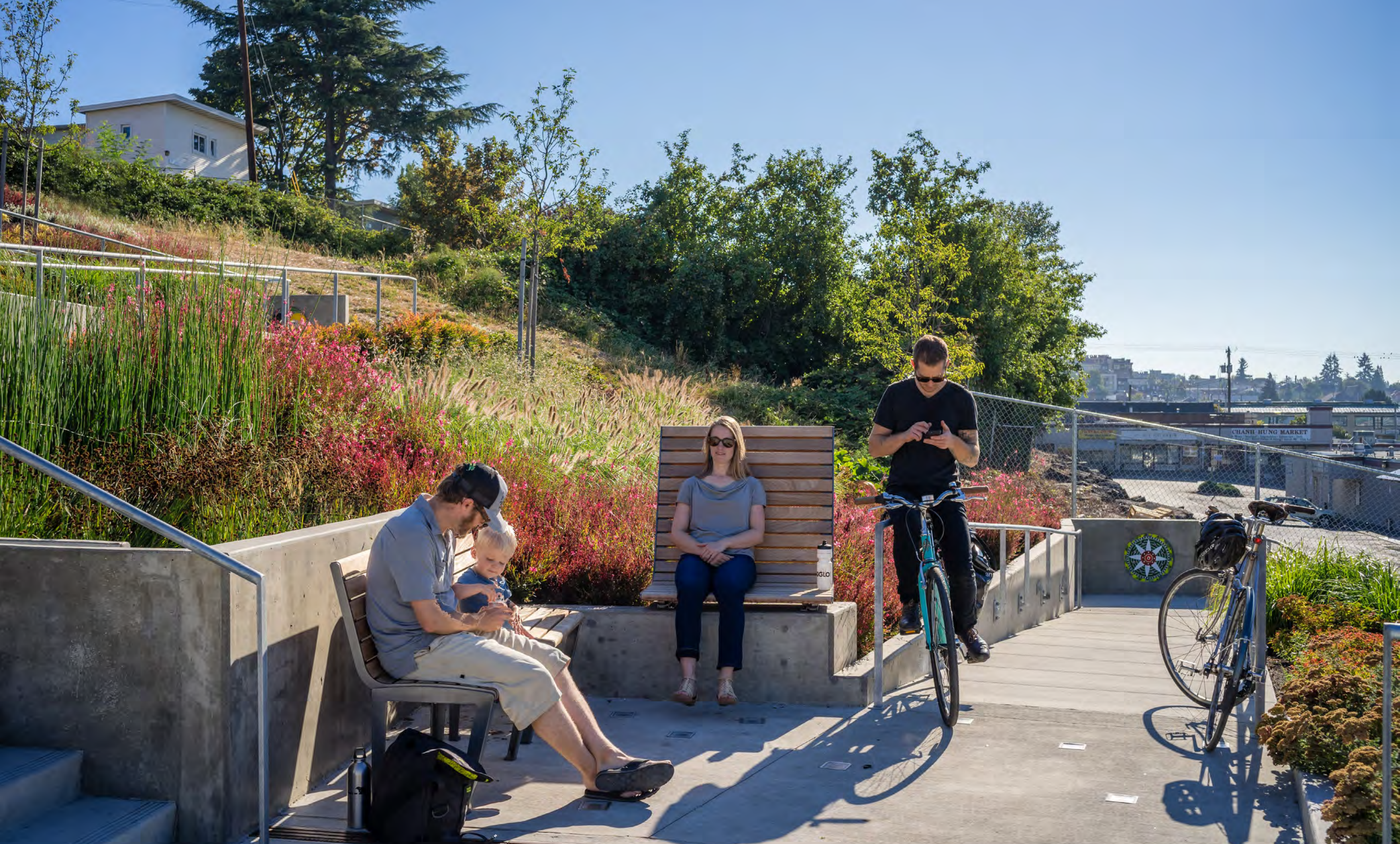
Generous landings at the stairs with seating pods to pause and gather.