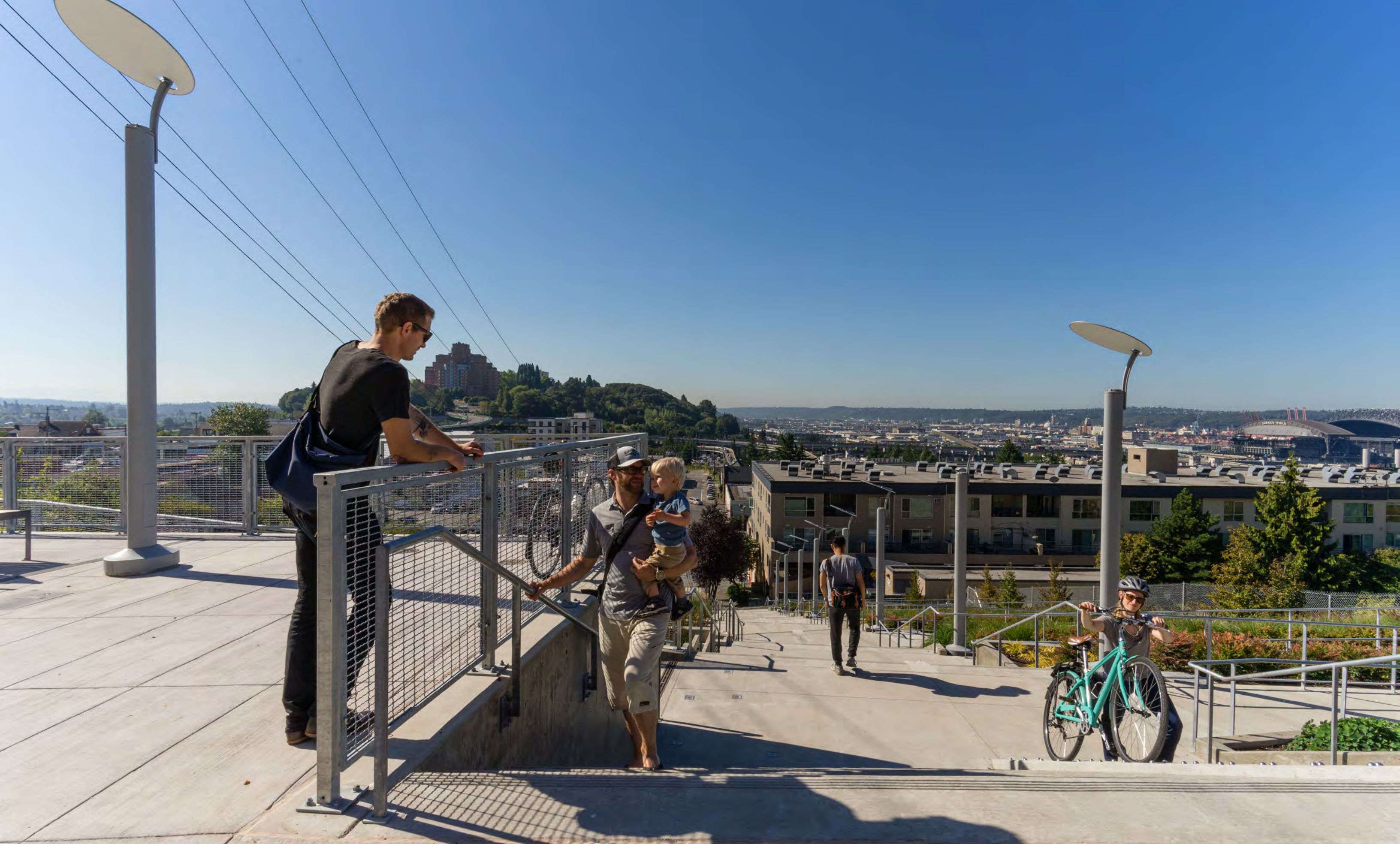
A view from the plaza of the stairs looking south.