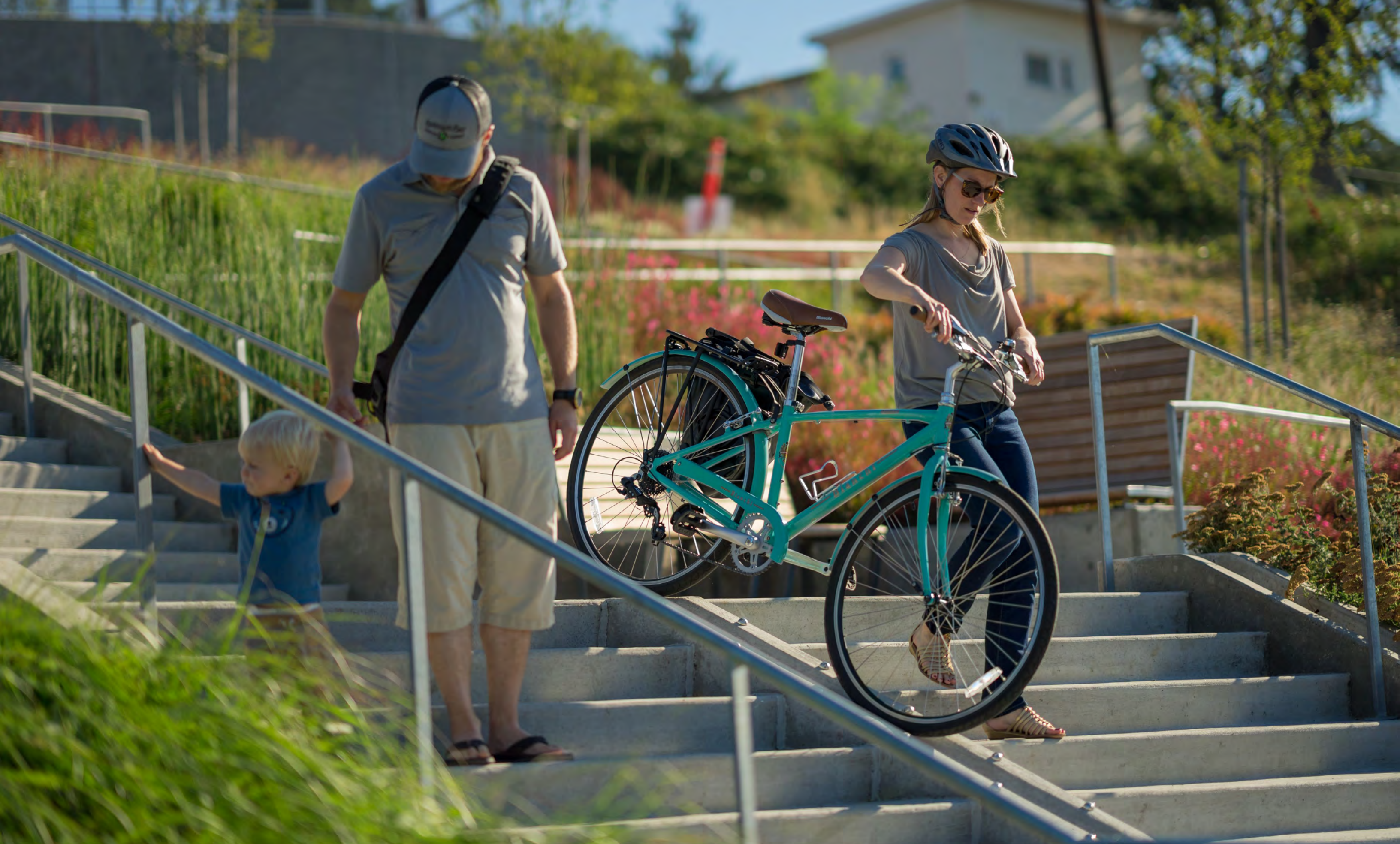
The Hillclimb stairs allow for multiple users to interact seamlessly.