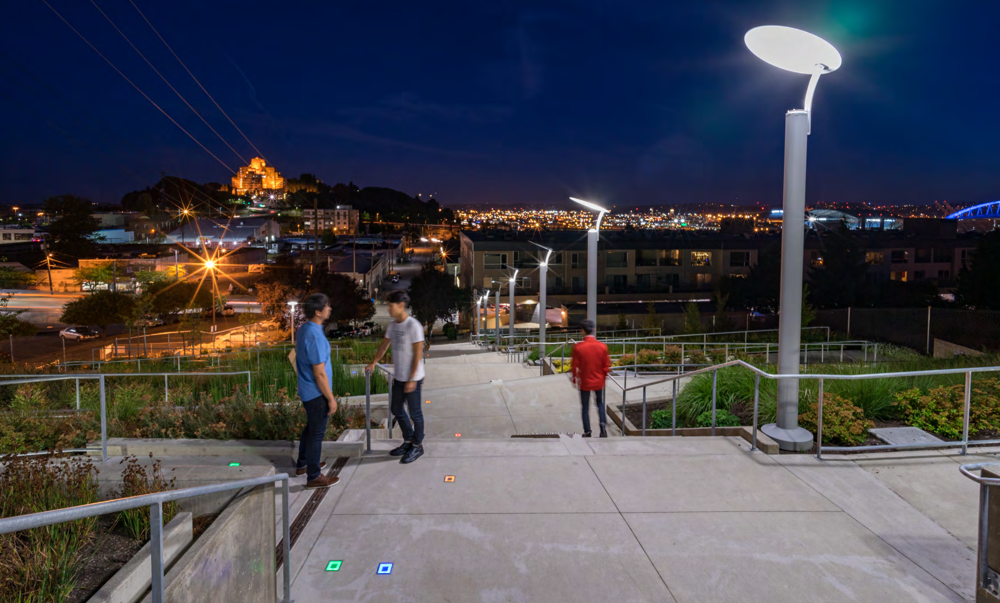
Light fixtures were carefully selected to ensure appropriate light levels and reduced glare.