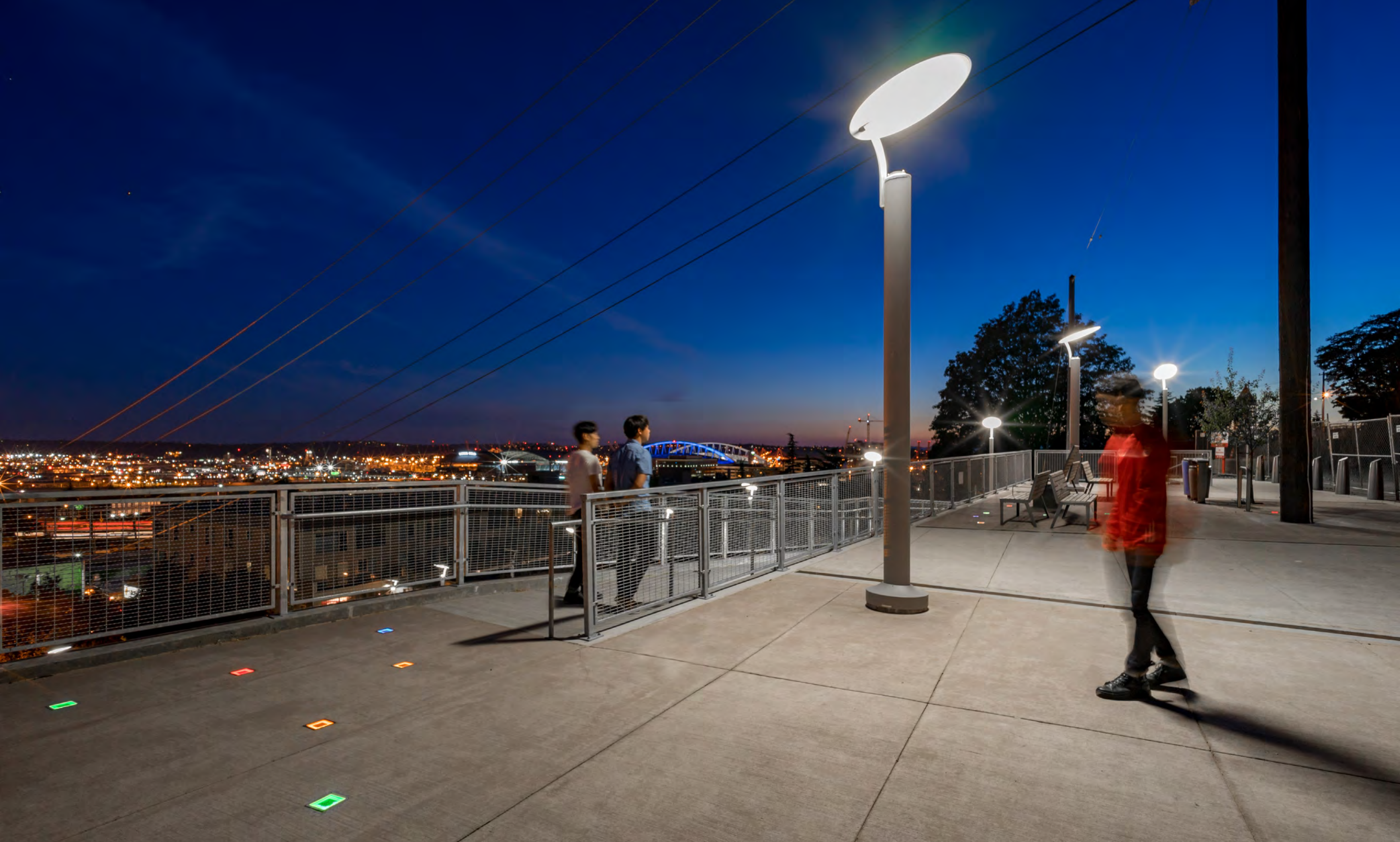
The Hillclimb is well-used and open to the public at all times. The space has reconnected neighborhoods and the community.