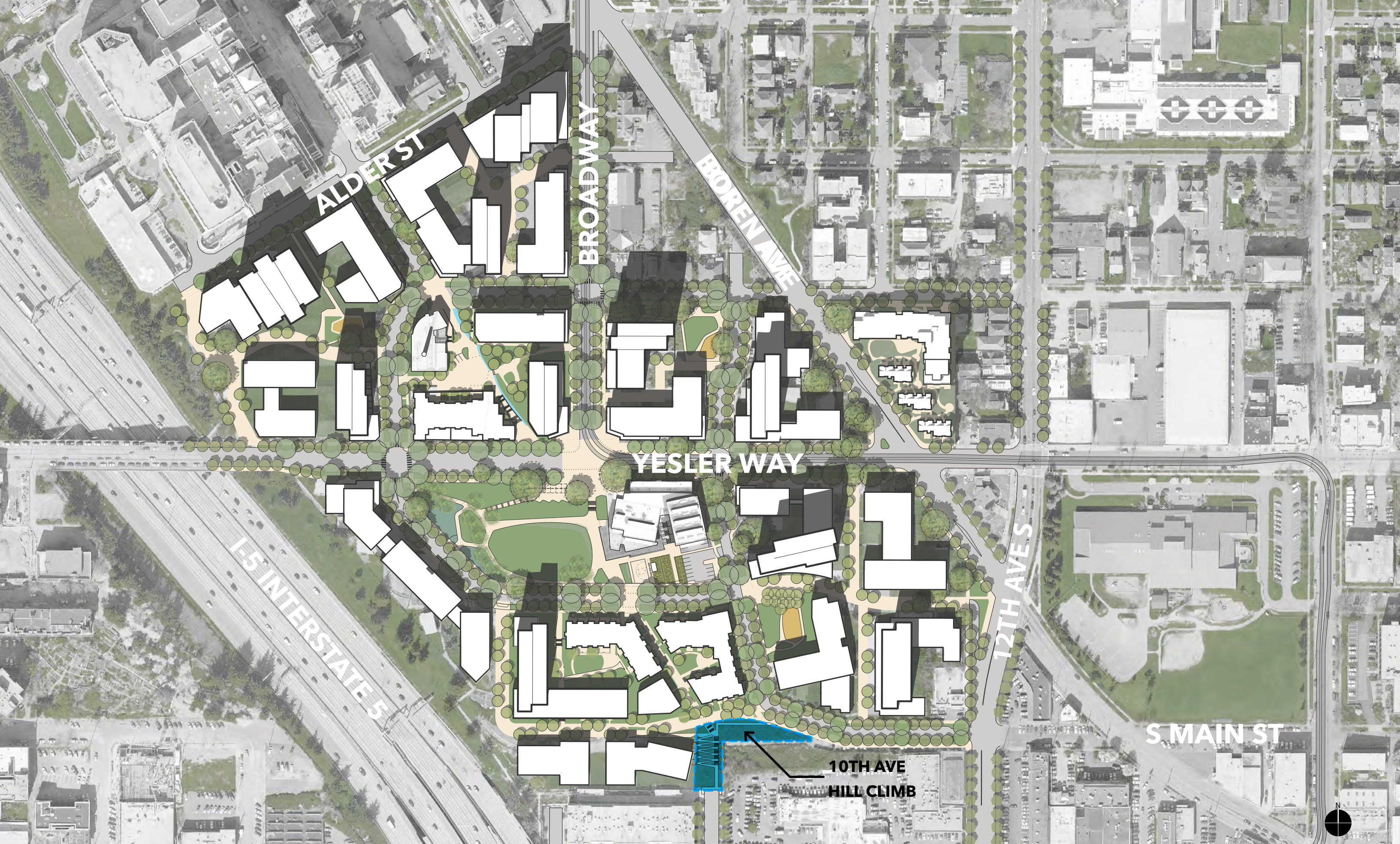
Illustrative Master Plan of Yesler Terrace.