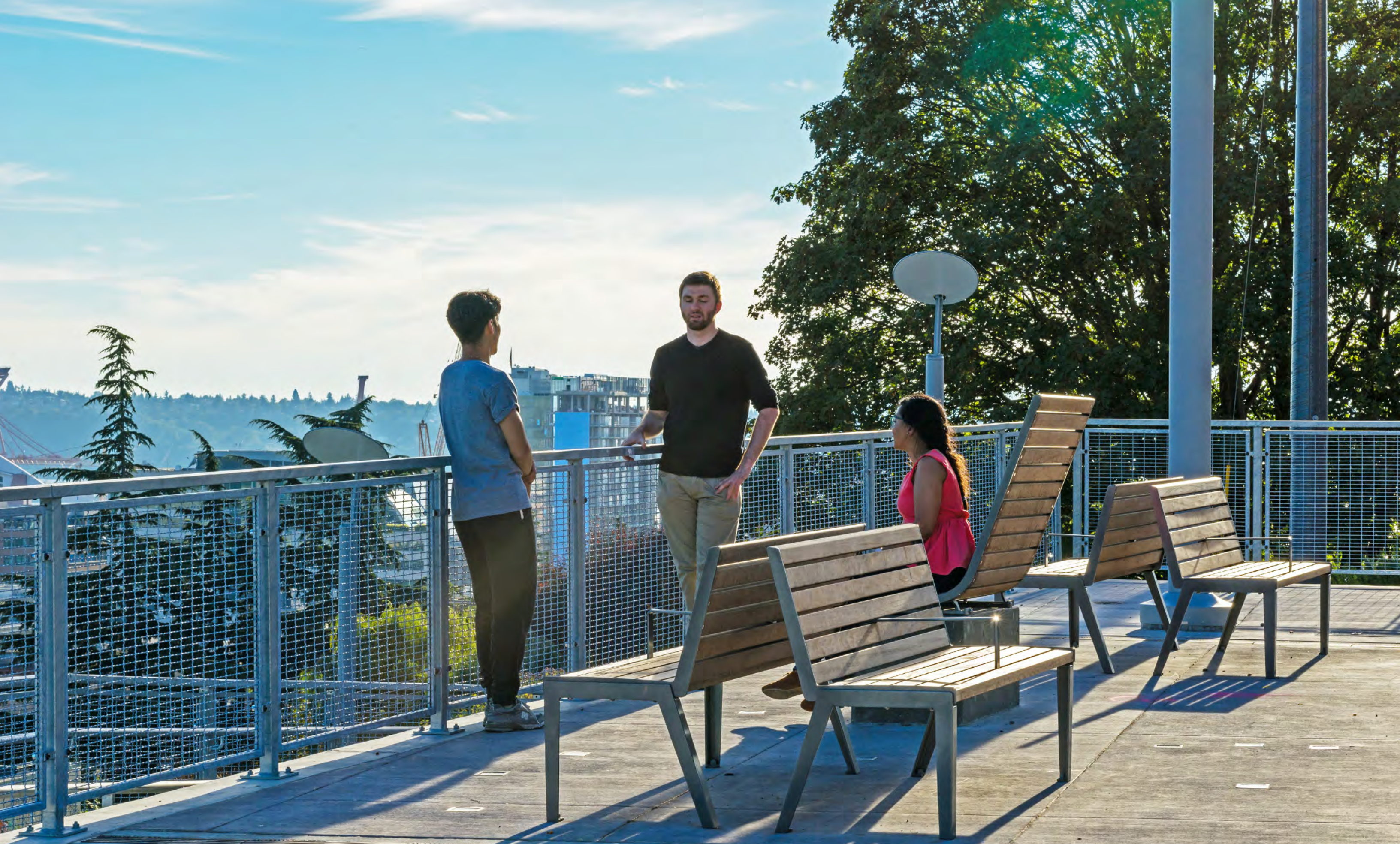
Seating groups are convivial and focus on the views.