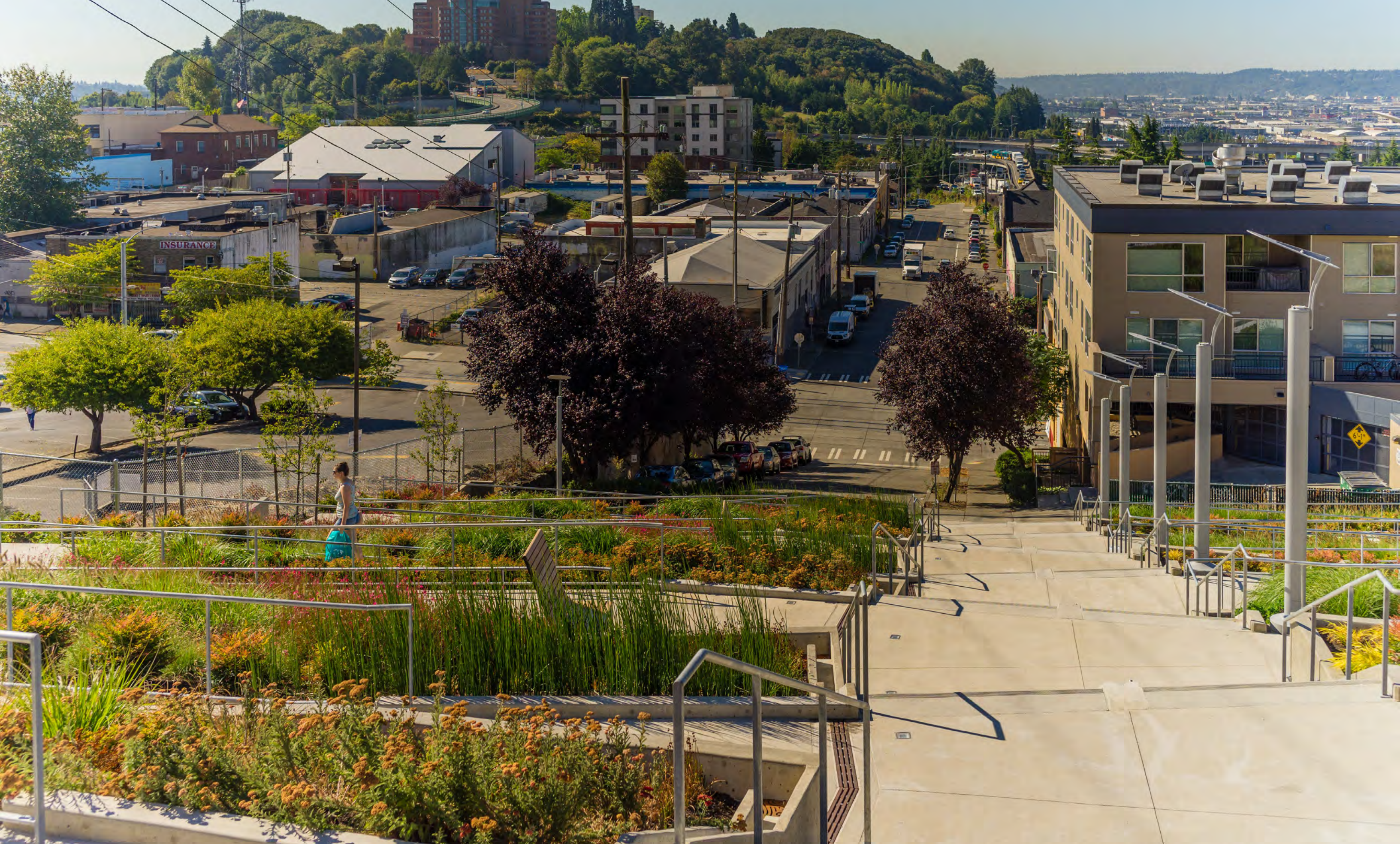
The plant palette is inspired by traditional colors from Vietnamese art.