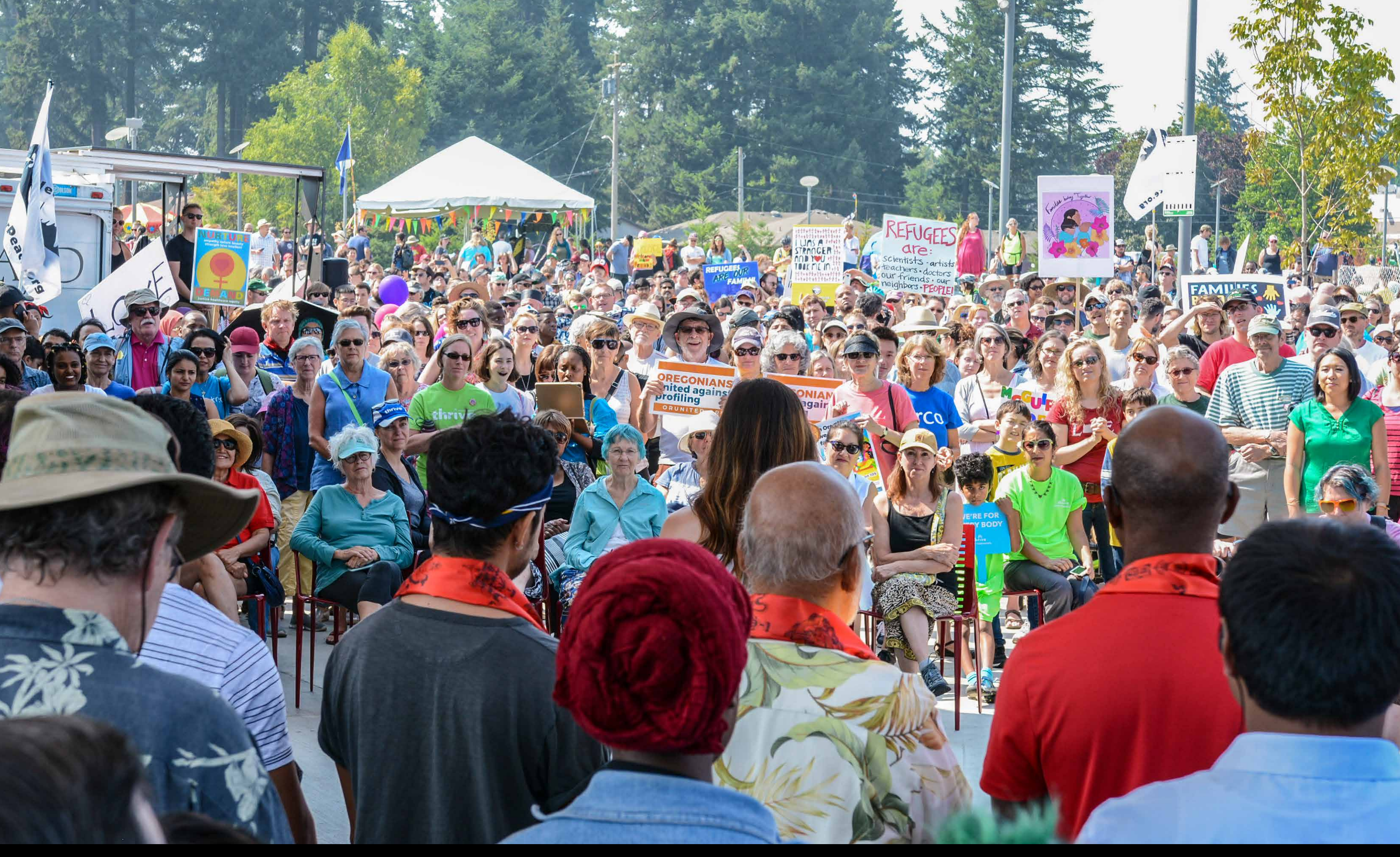
Social Equity. Bringing Portland closer to addressing historic inequalities, Gateway Discovery Park provides access within a half-mile walk to over 800 households. One-third of these households are racial or ethnic minorities, and a quarter are living in poverty.