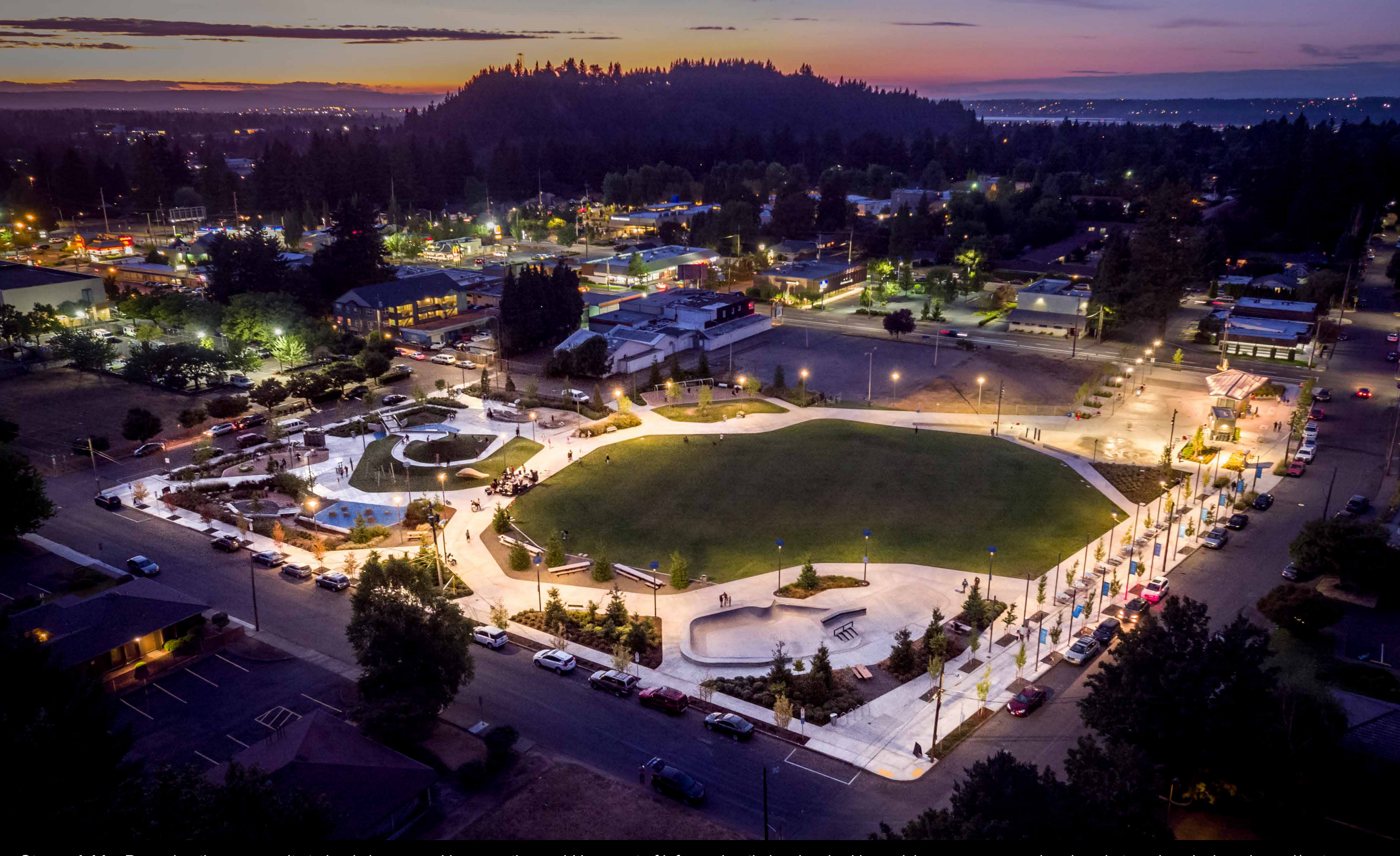
Stewardship . Preparing the community to lead change and improve the world is an act of informed optimism inspired by a civic open space embracing skatepark, splash pad, sand/water discovery, performance space, picnic grove, active paseo and nature play.