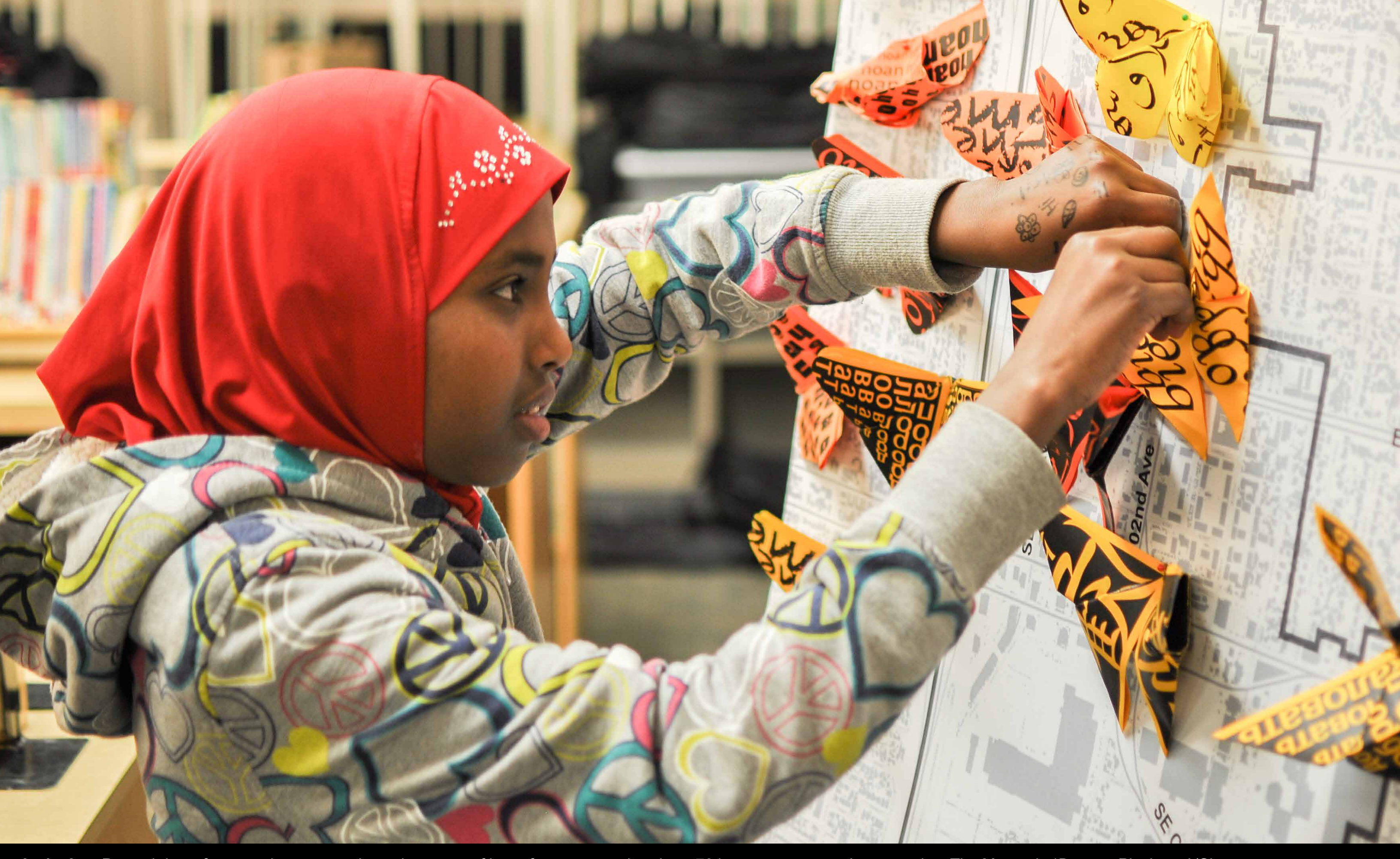
Inclusion . Passed down from previous generations, the power of hope for a community where 70 languages are spoken, remains. The Monarch, 'Danaus Plexippus' (Sleepy Transformation) sparks this journey through a series of community engagement gatherings and celebrations.