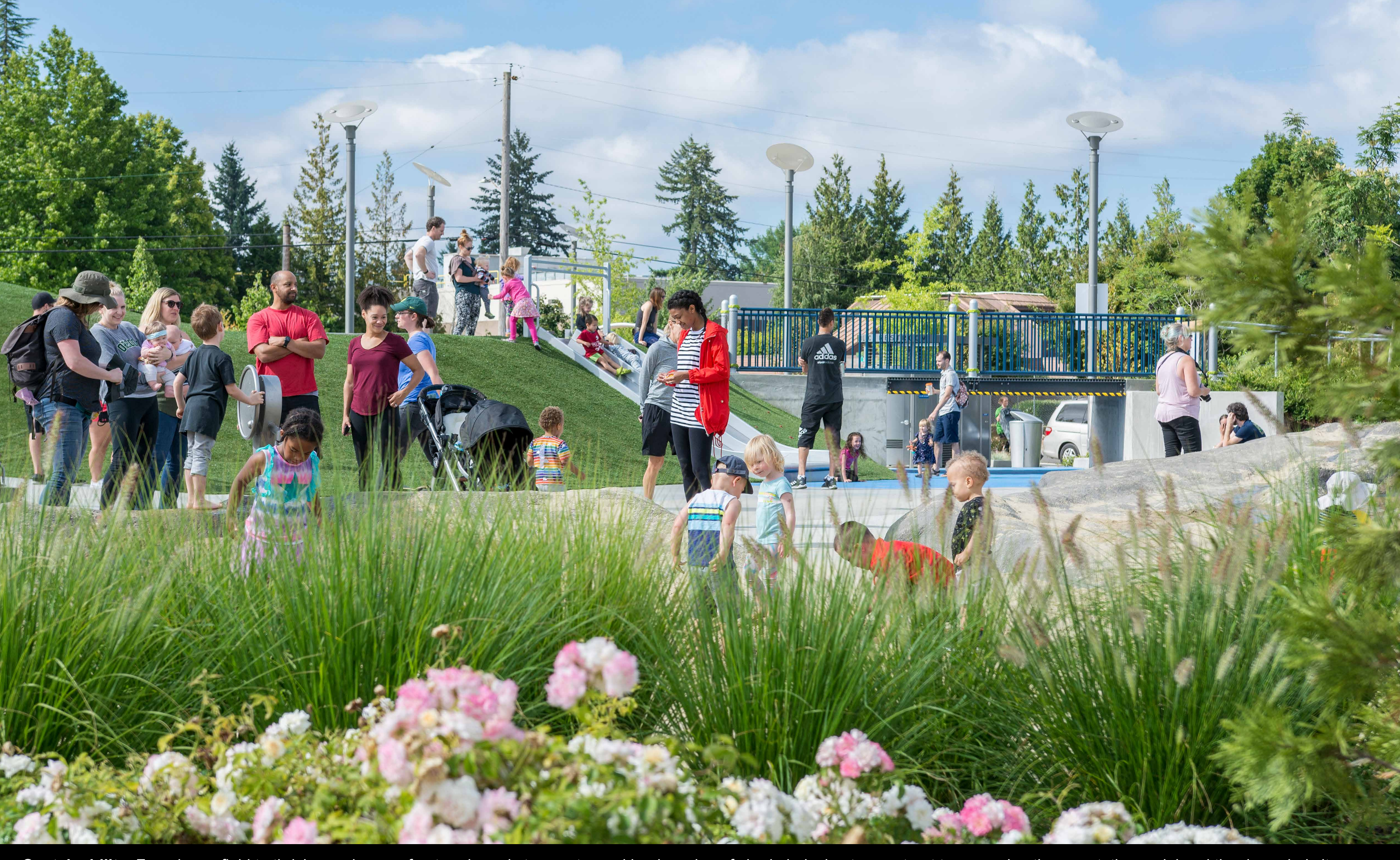
Sustainability . From brownfield to thriving park, use of nature-based stormwater and landscaping of shade inducing trees, street trees, and native vegetation reclaimed the degraded site promoting green infrastructure that recreates lost hydrologic function and enhances Gateway's EcoDistrict placemaking goals.