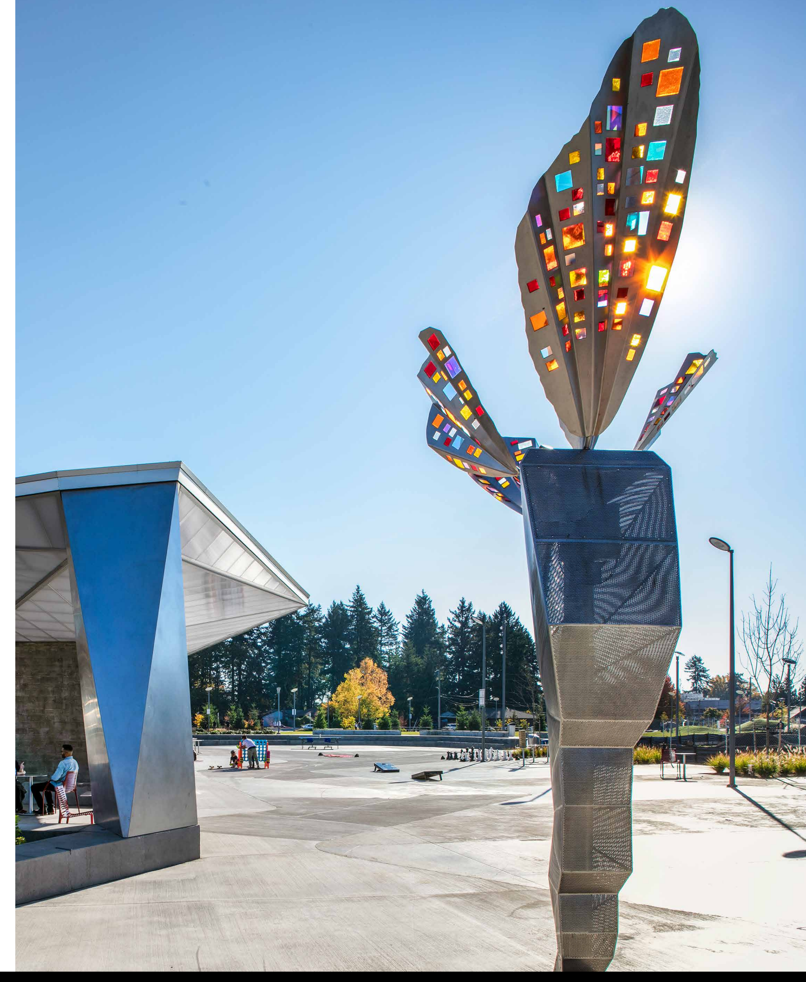
Transformation . The majestic butterfly wings, the Fifth Wind , represent symbolically a gratitude and appreciation for the selfless contributions of the Gateway community members narrating their journeys, ancestral and contemporary.