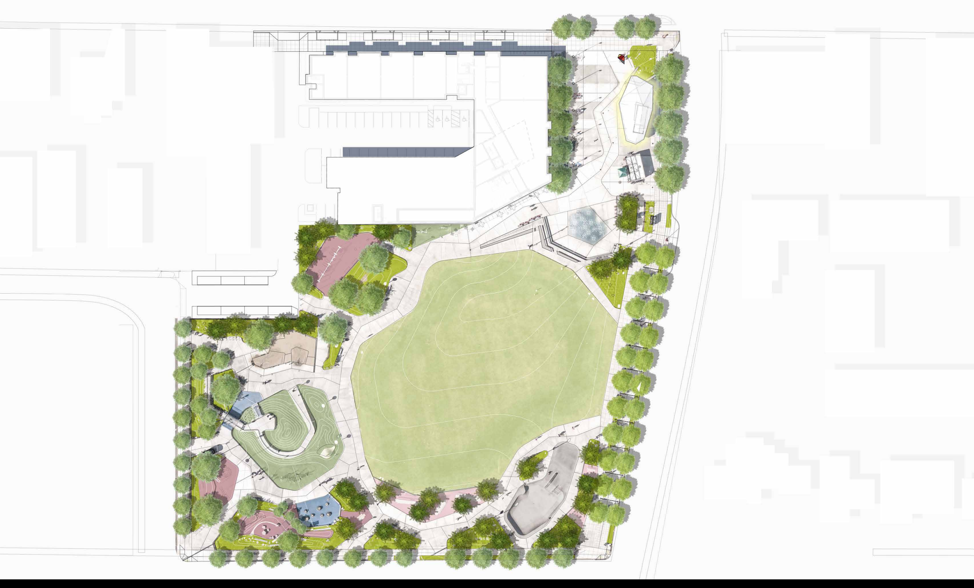
Urban Wonderland . Completed prior to COVID-19, at the edge of Portland's displacement zone, near a confluence of freeways and light-rail transit stops, this urban wonderland provides a daily oasis of hope as a counter to mental fatigue during the pandemic.