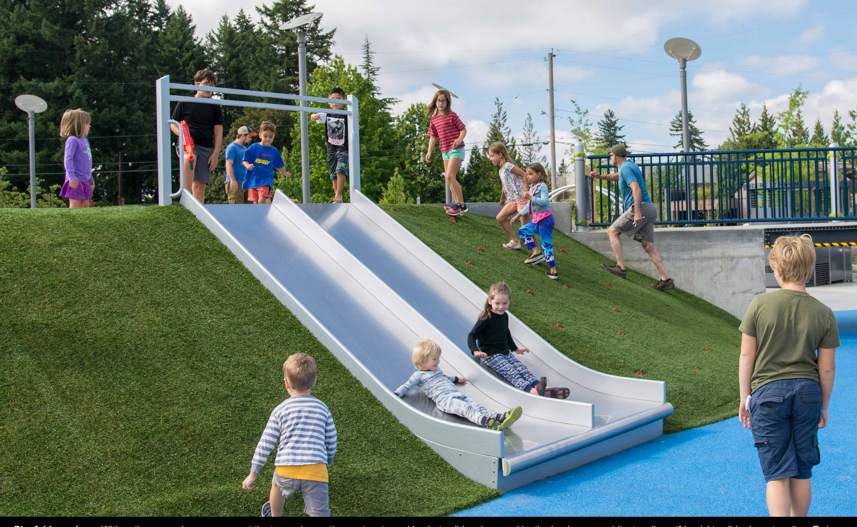
Playful Learnings. With pathways and ramps, once at the top an innovative custom two-wide chute slide, pioneered by the landscape architects, allows 'friends' to slide down together. Today, you'll find this slide at every inclusive designed park throughout Portland.