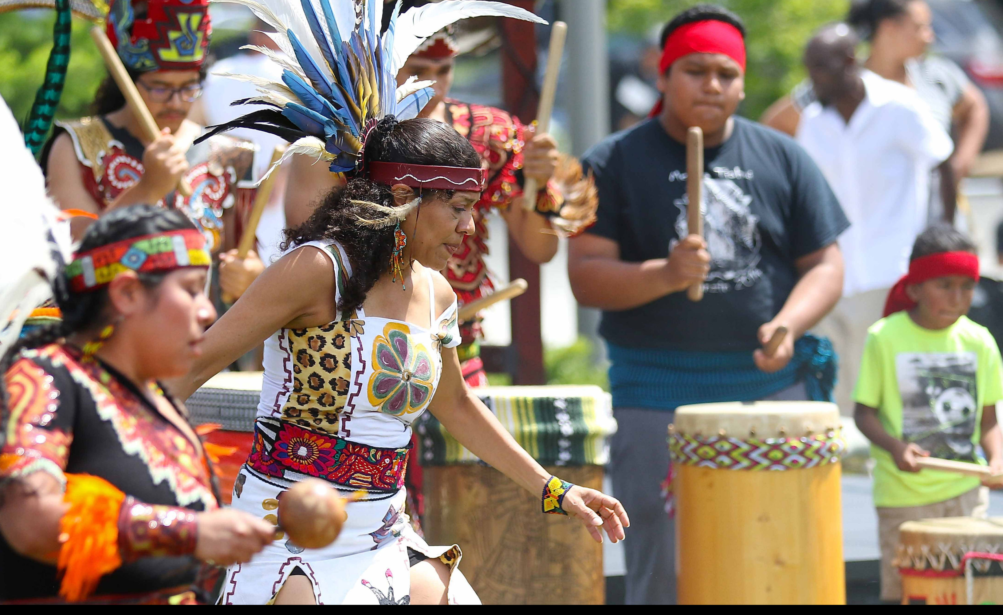
Reverence . Long before a shopping center thrived and perished, and more recent immigrants enlivened the Gateway community; Cowlitz, Cascades, and Confederated Tribes of Grand Ronde have been stewards of this land.