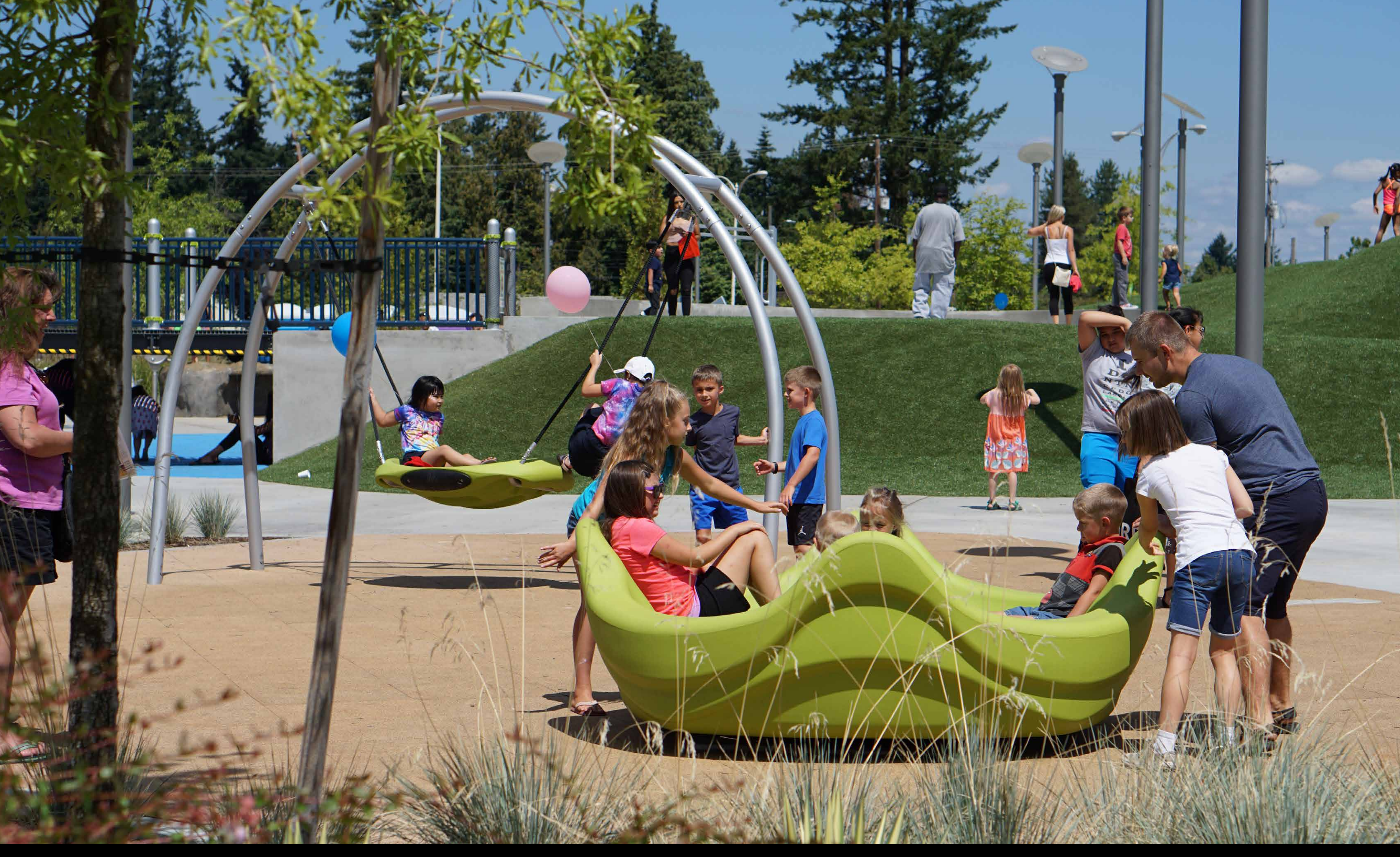
Memories . Sustainable playground surface materials are designed to fit in the landscape and feel cohesively integrated into nature with paths winding up and down over differing heights of topography accessible by all.