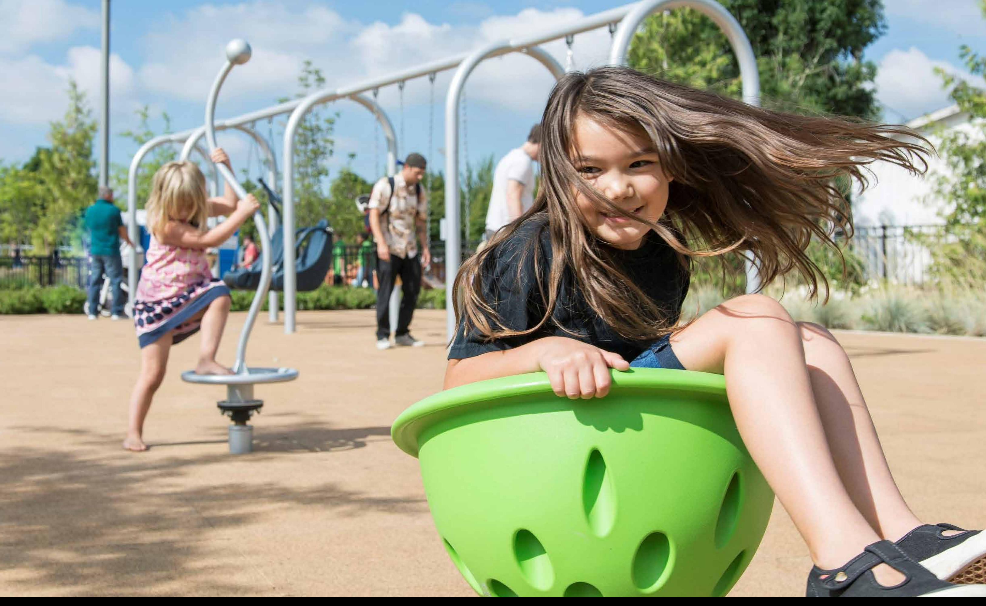
Joy . As the living room for East Portland, Gateway Discovery Park is a beloved gem and a strategic neighborhood asset addressing the immediate and lasting consequences of COVID-19 - offering a safe and joyous haven for all.