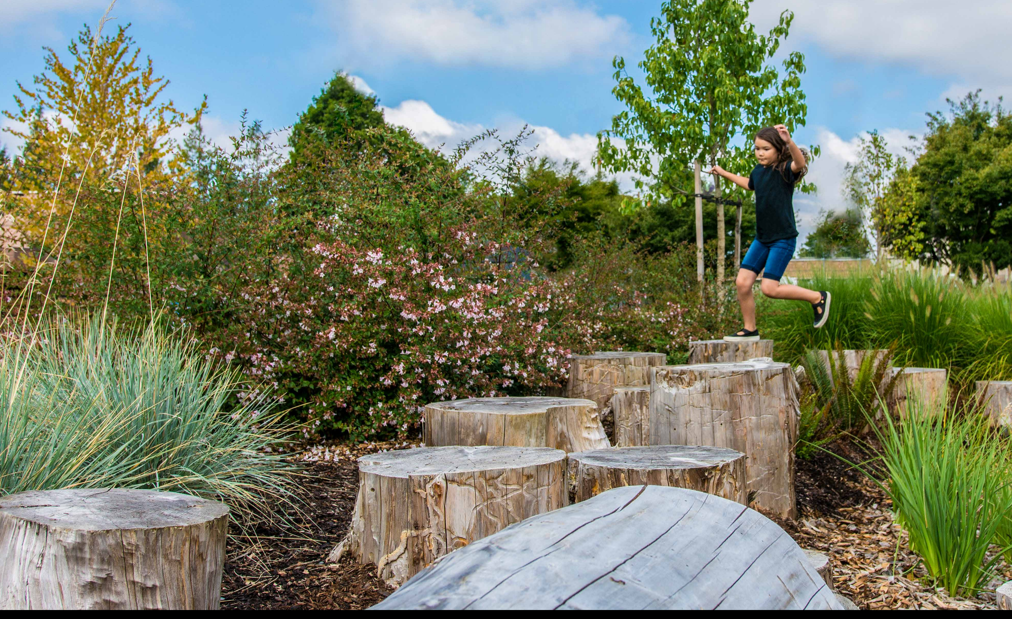
Biophilia . Engaging with the environment through tactile manipulation, direct observation, and first-hand experience the natural play area was designed to evoke both the serenity and liveliness of being in the woods for all who lack direct access with nature.