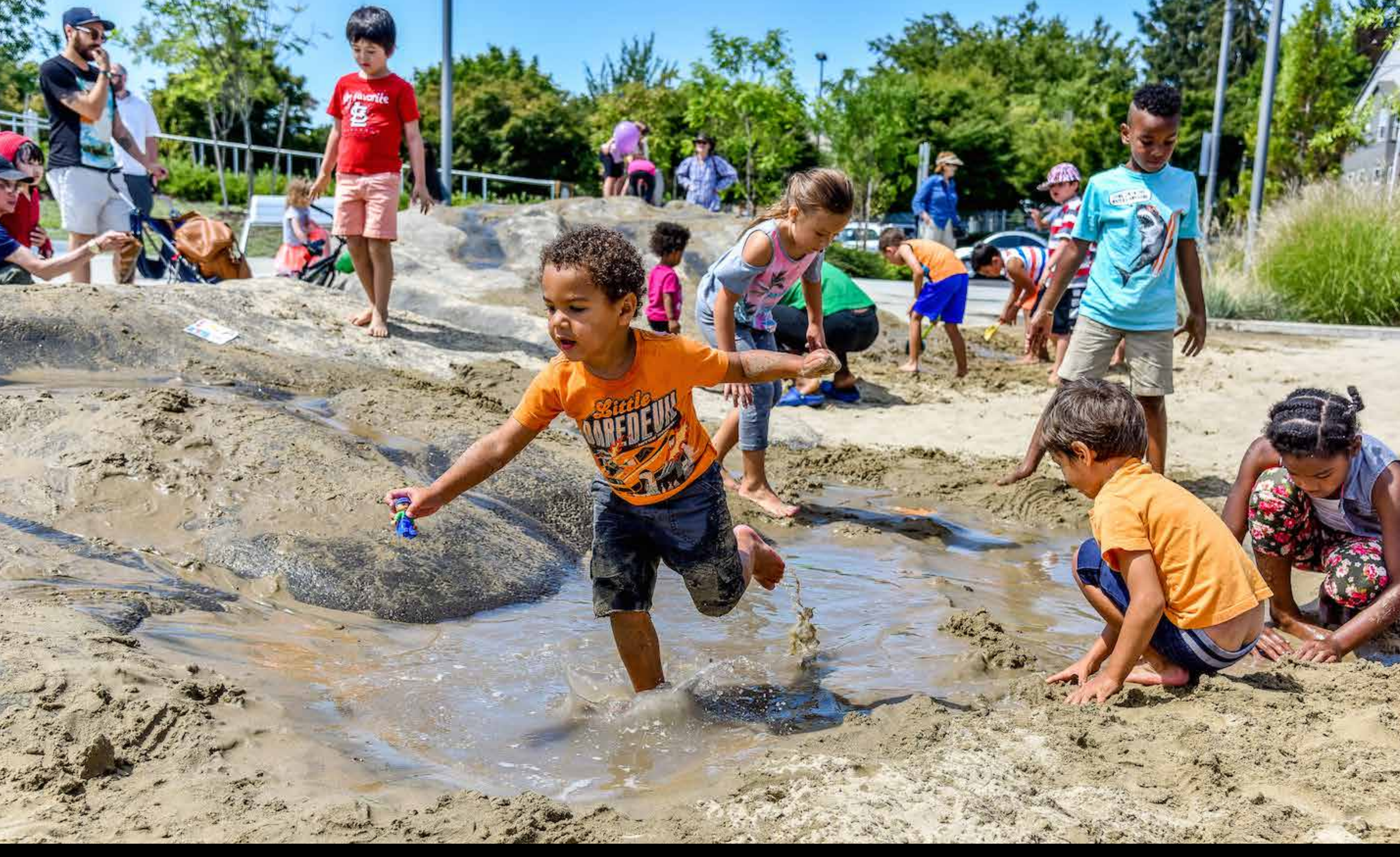
Sensory Rich Experience. Sand and water are critical organic elements found in the playground. A hand-operated wheel pumps water onto an elevated sand table (custom designed to accommodate wheelchairs) where the two materials mix with natural cooperation.