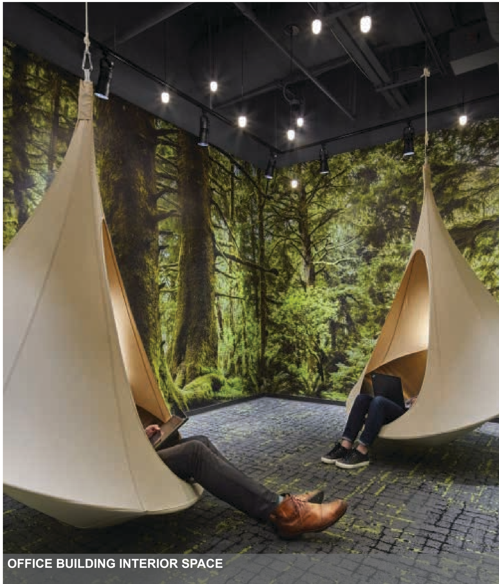
OFFICE BUILDING INTERIOR SPACE