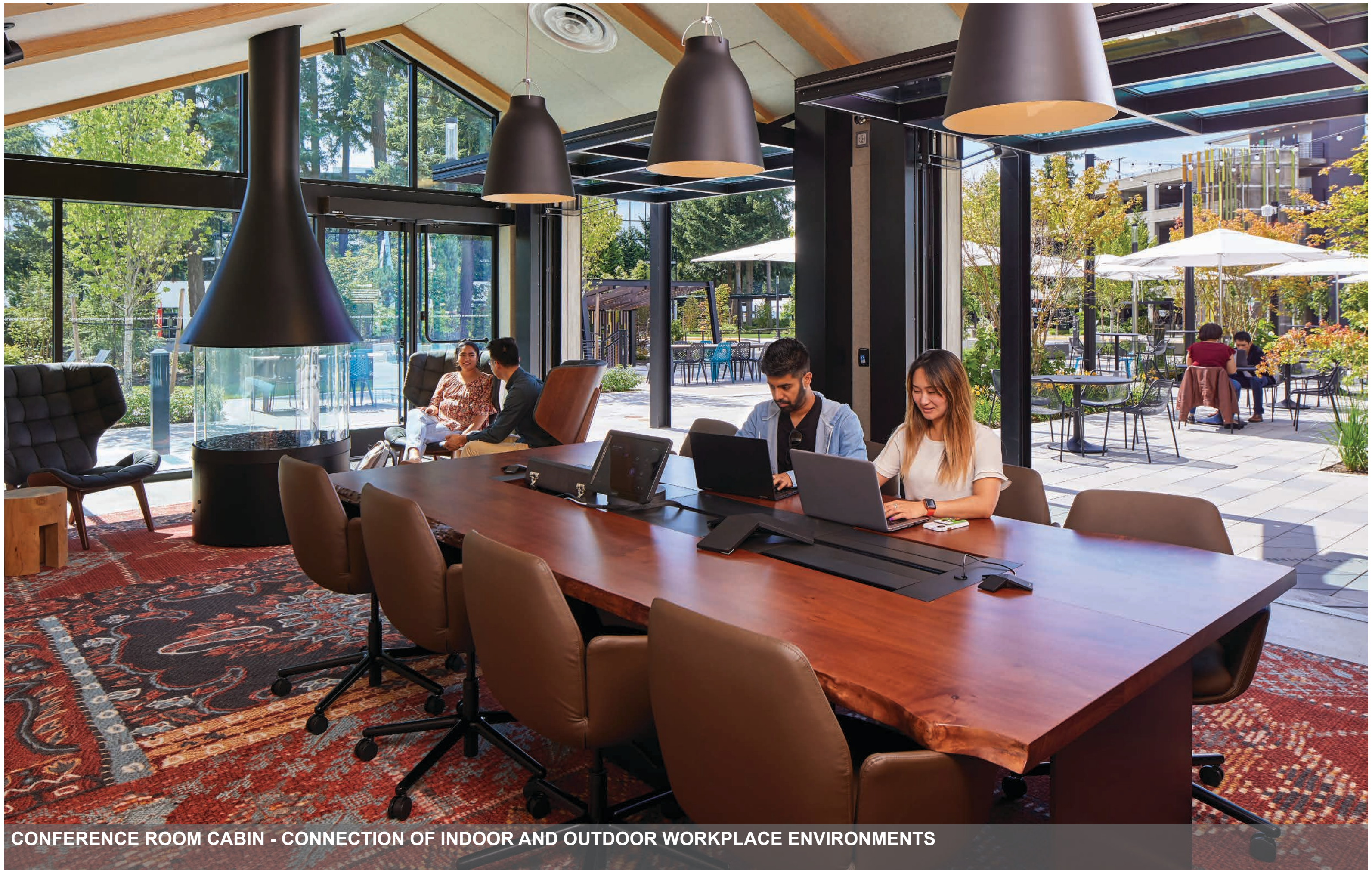
CONFERENCE ROOM CABIN - CONNECTION OF INDOOR AND OUTDOOR WORKPLACE ENVIRONMENTS