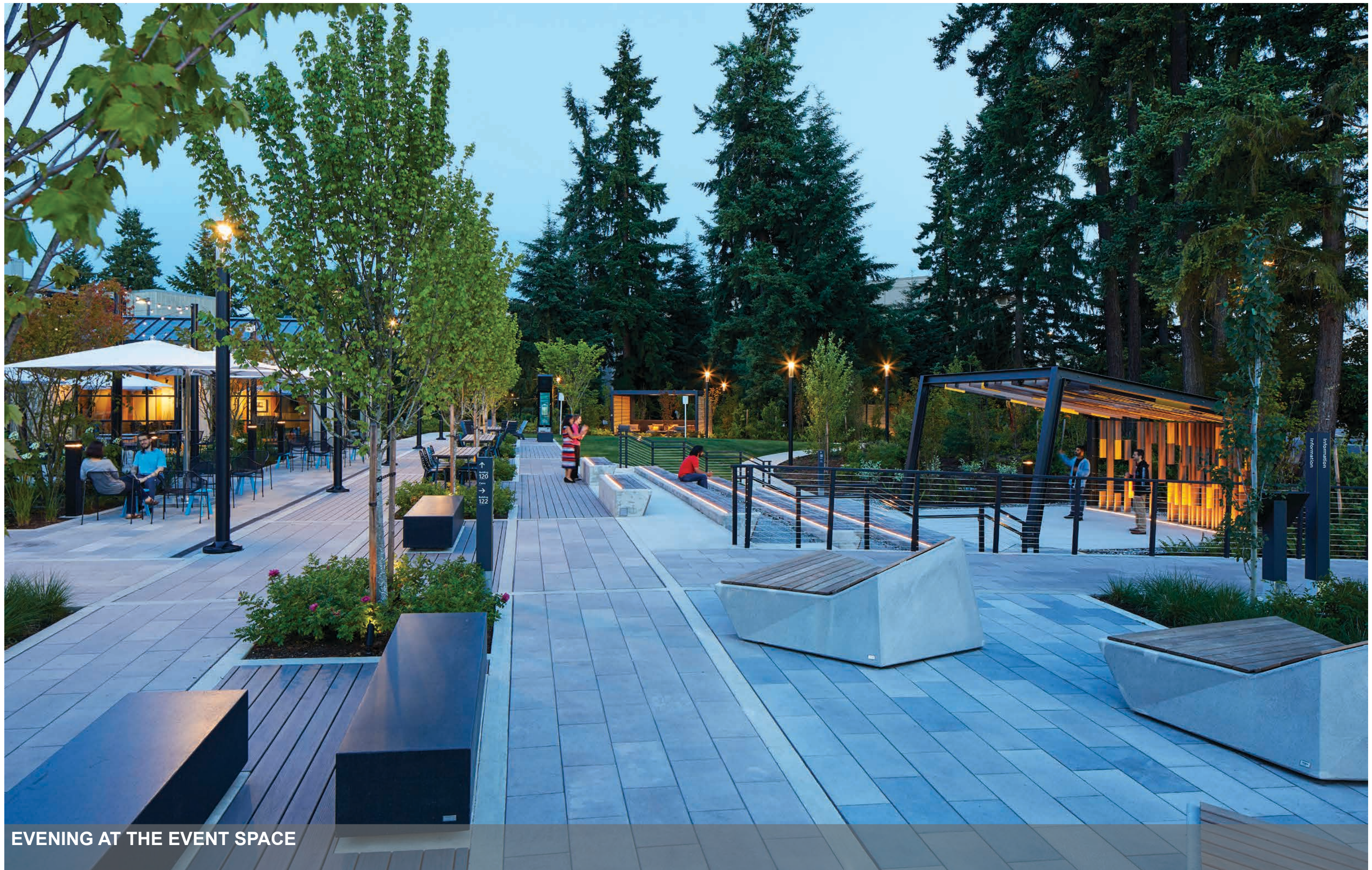
EVENING AT THE EVENT SPACE