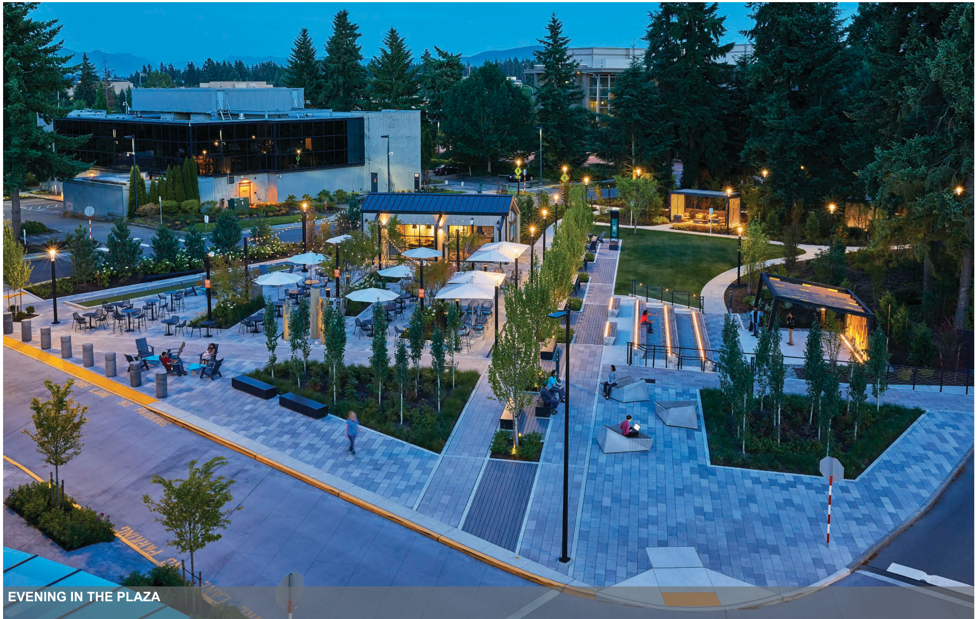
EVENING IN THE PLAZA