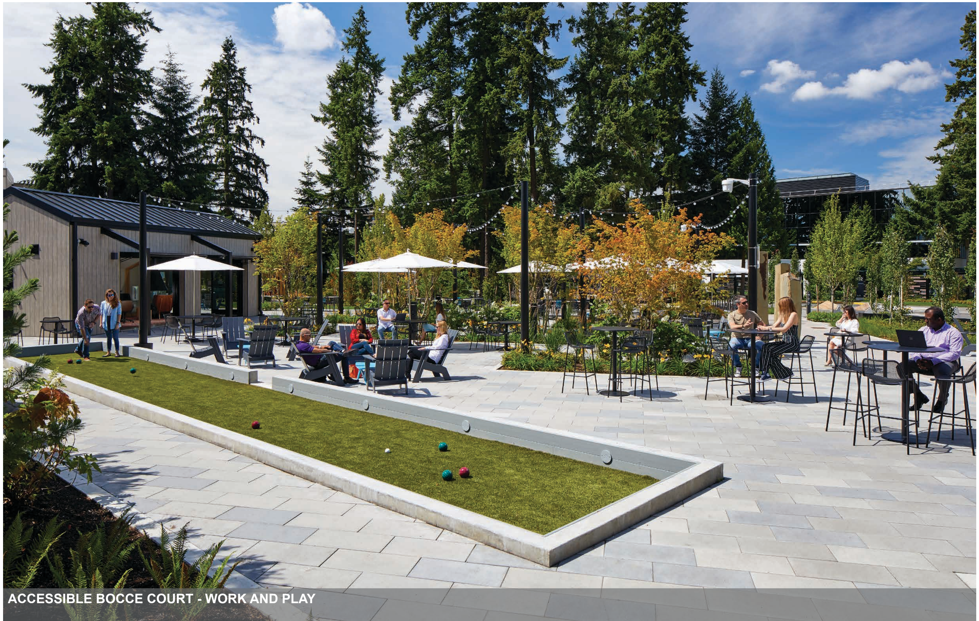
ACCESSIBLE BOCCE COURT - WORK AND PLAY