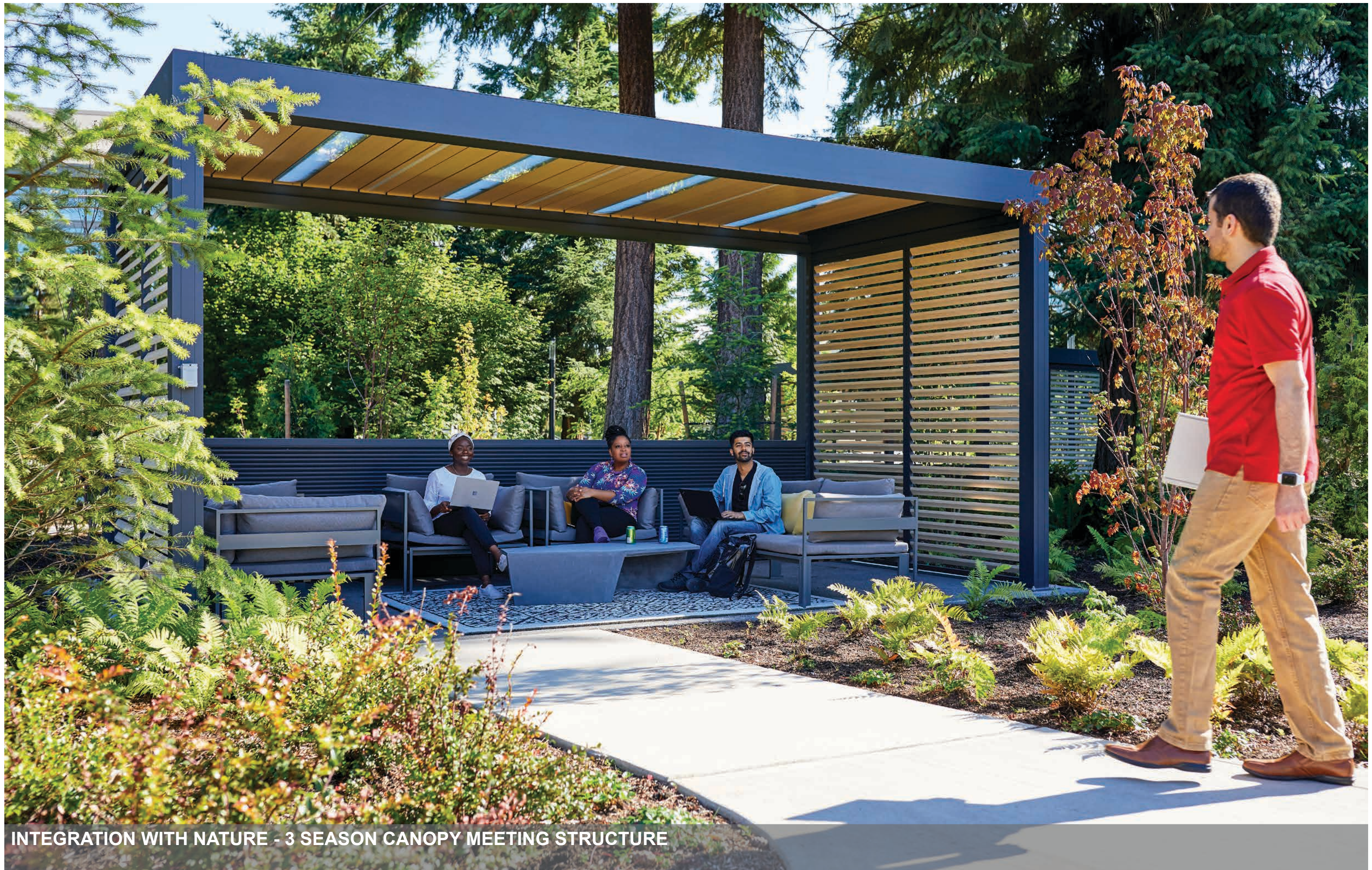
INTEGRATION WITH NATURE - 3 SEASON CANOPY MEETING STRUCTURE