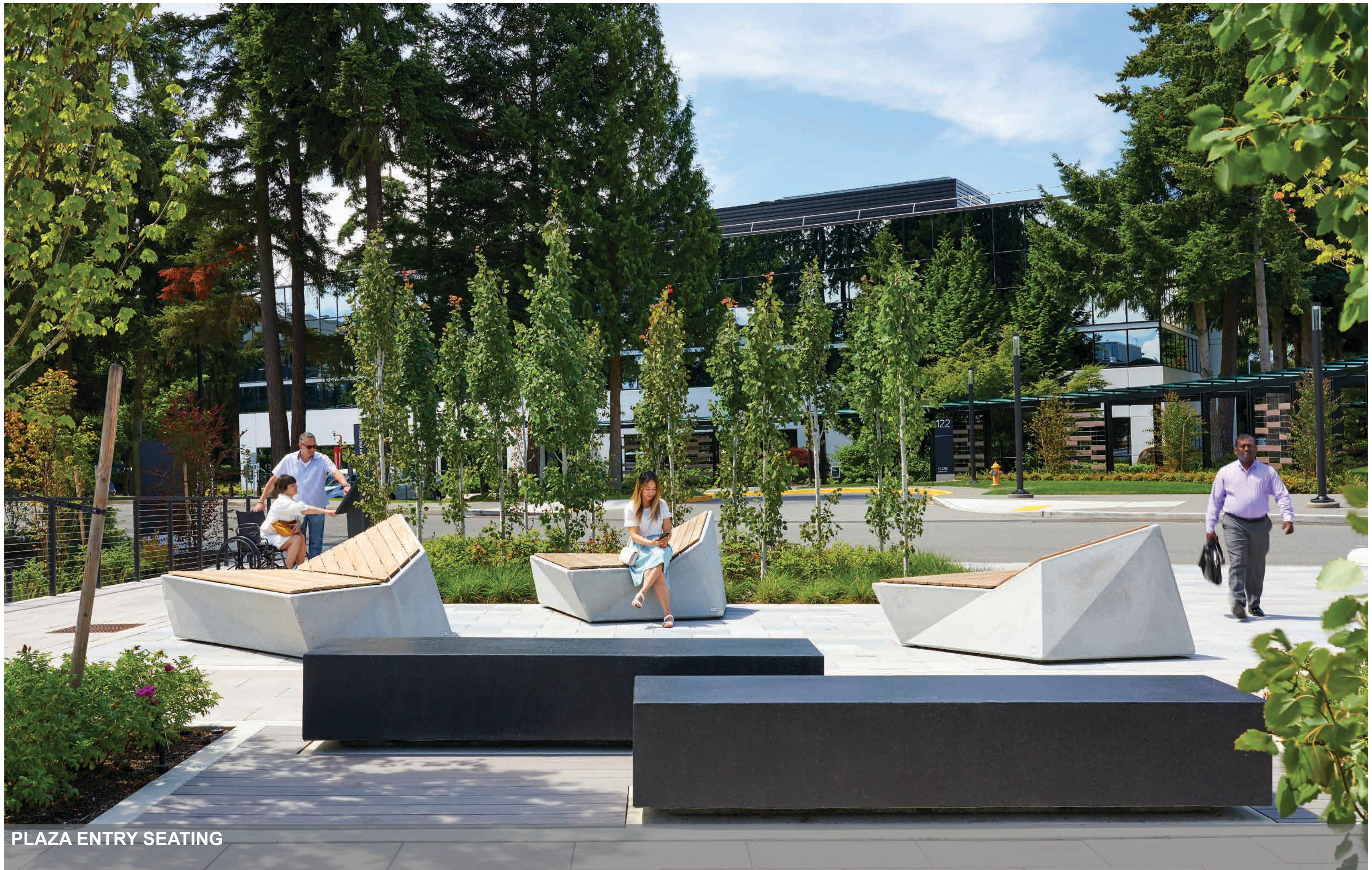
PLAZA ENTRY SEATING