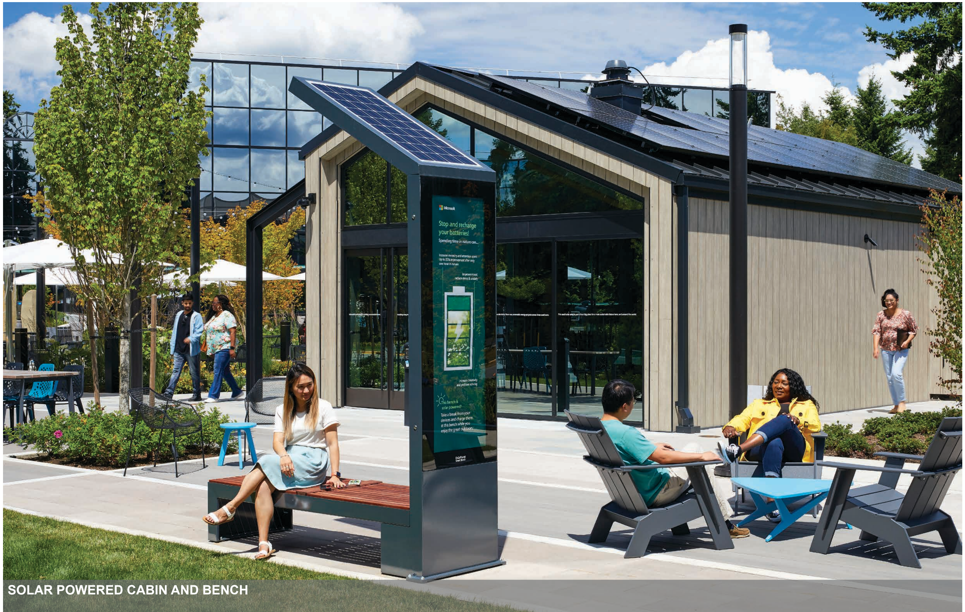
SOLAR POWERED CABIN AND BENCH