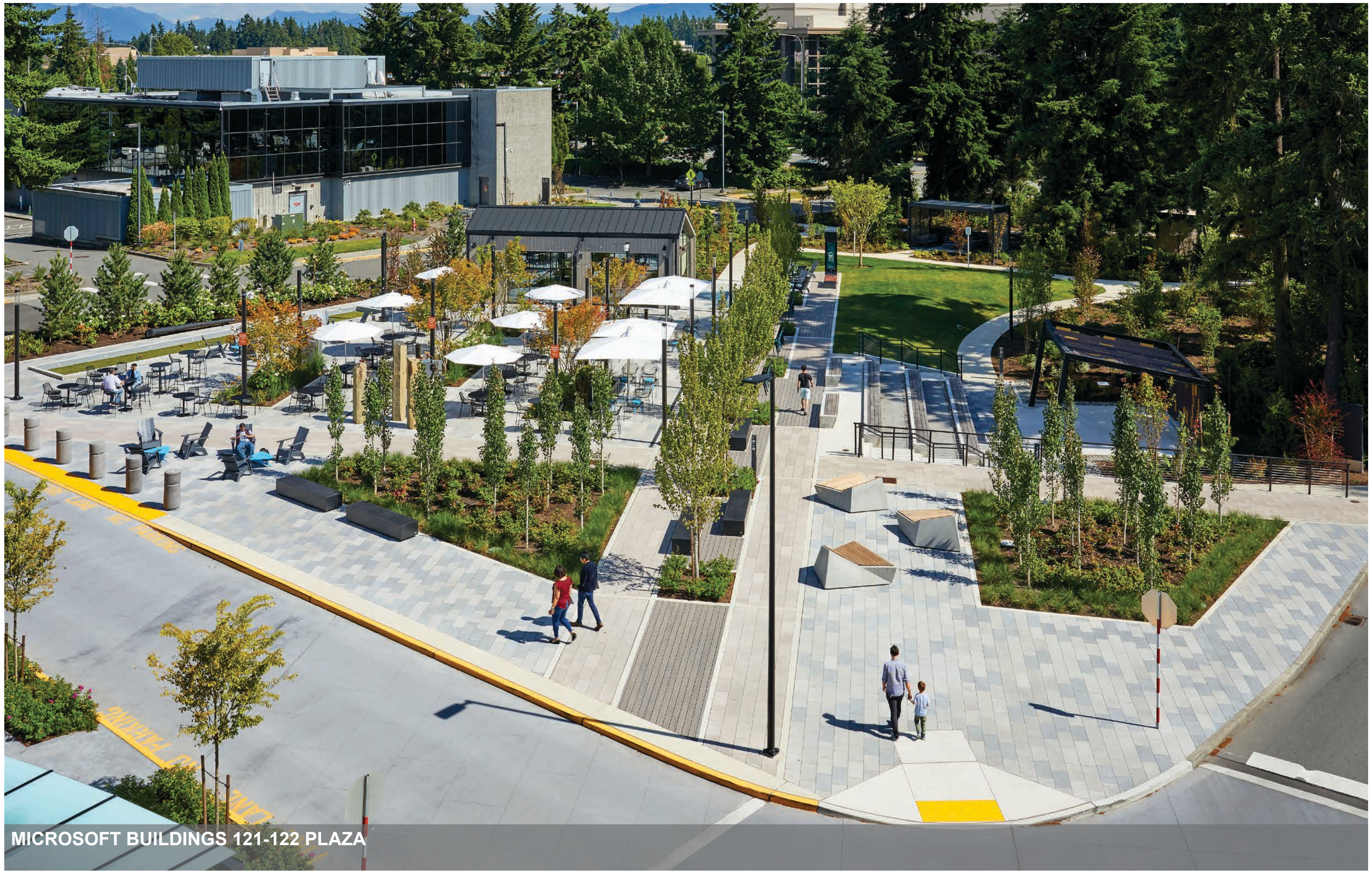
MICROSOFT BUILDINGS 121-122 PLAZA