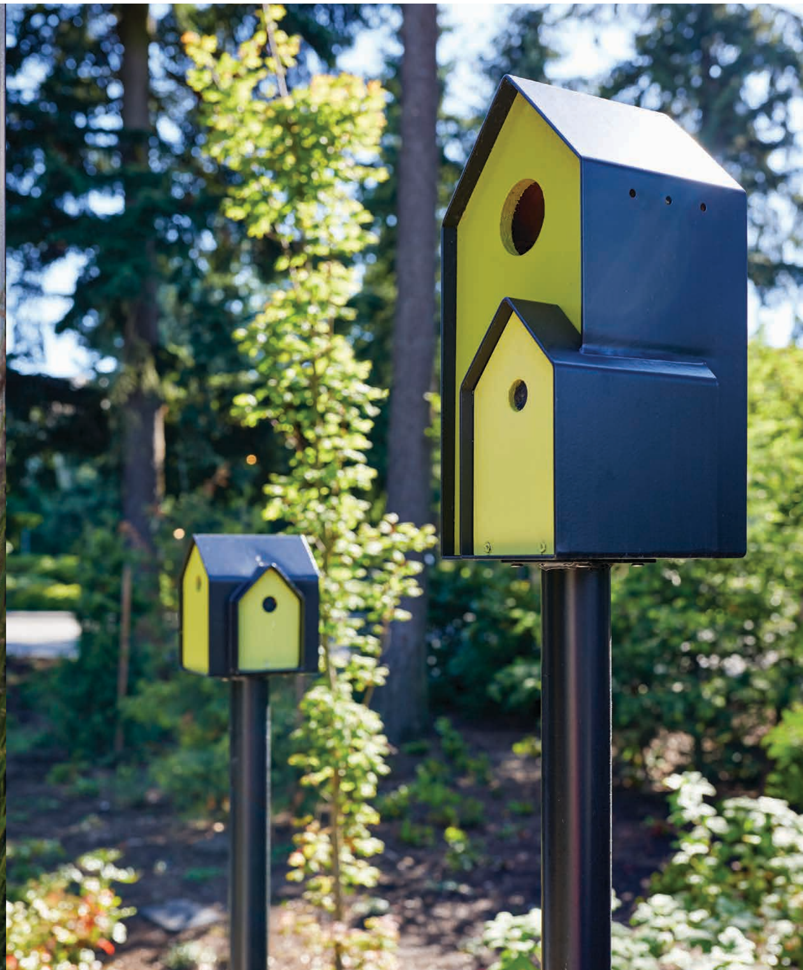
ART AS FUNCTION - CANOPY SCREENS AND BIRD HOUSES