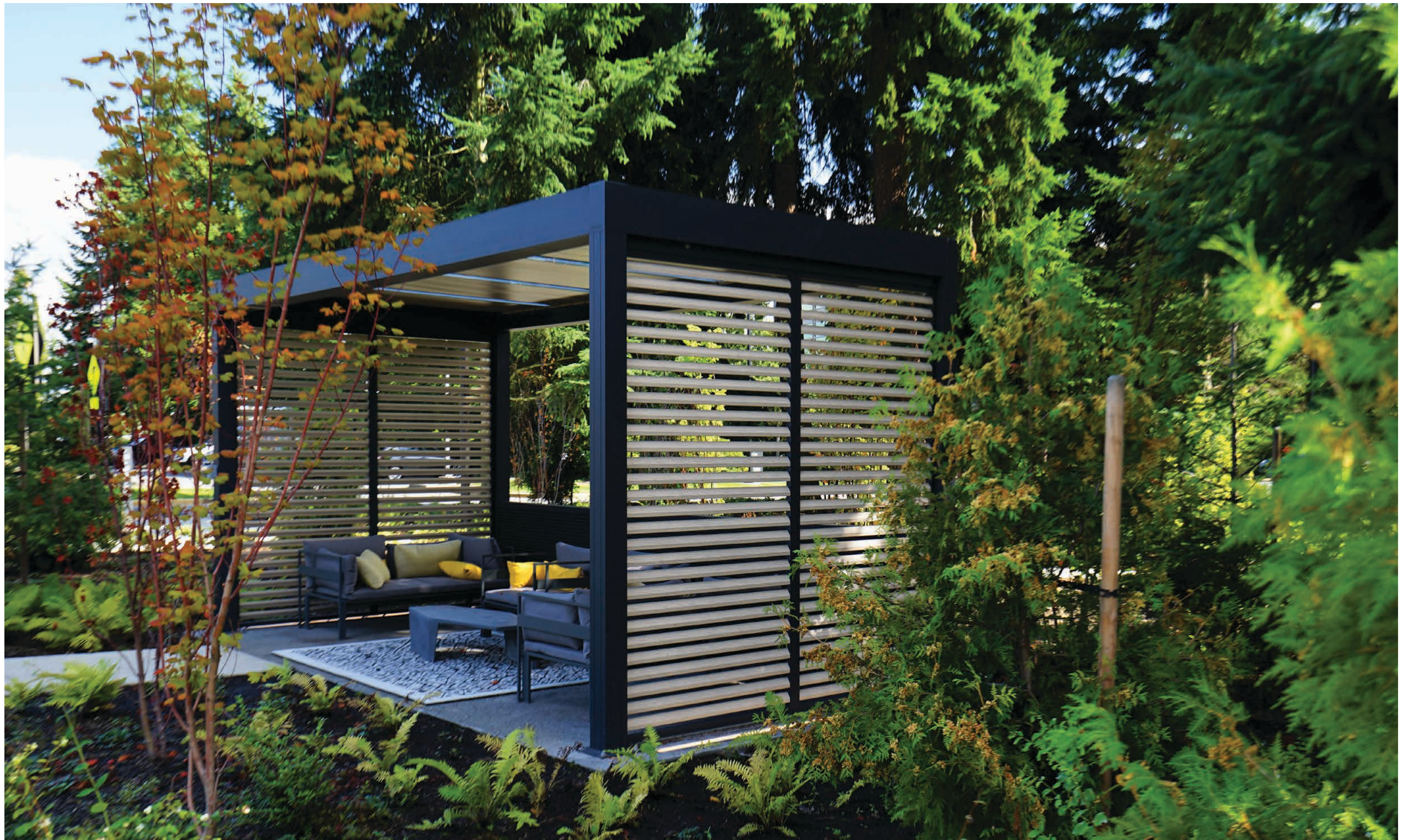
SATELLITE OUTDOOR WORKPLACE IN A NATIVE FOREST SETTING