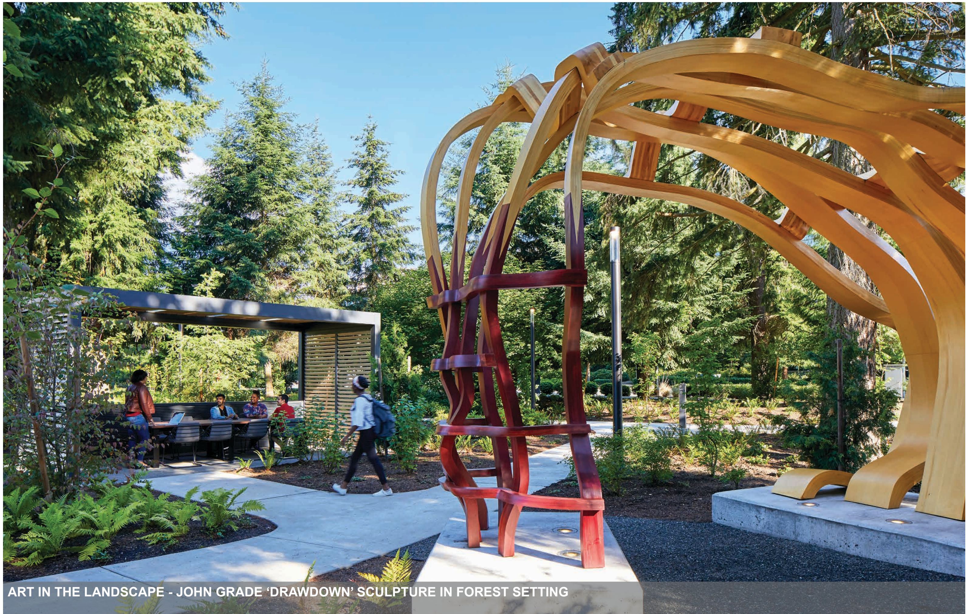
ART IN THE LANDSCAPE - JOHN GRADE 'DRAWDOWN' SCULPTURE IN FOREST SETTING