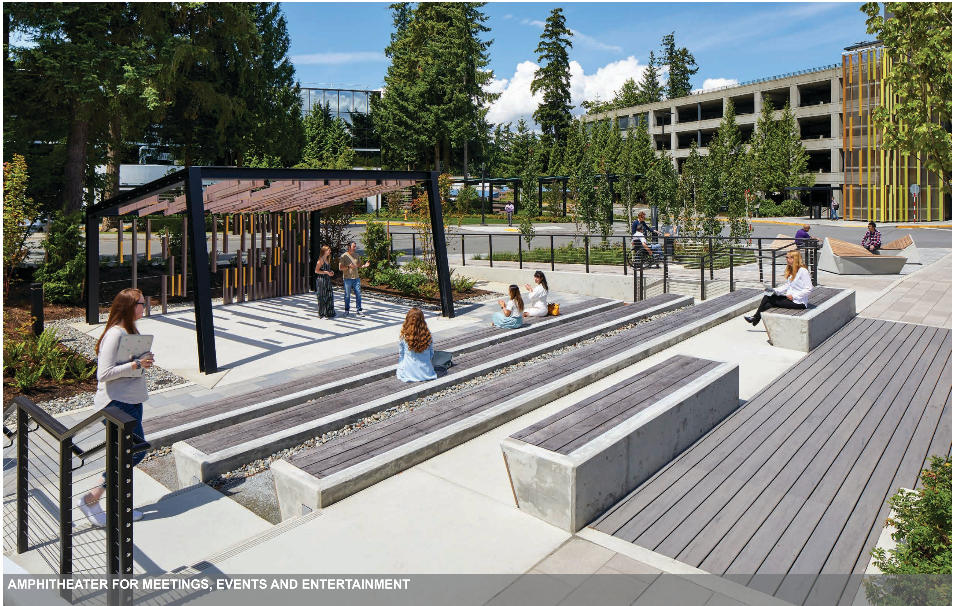
AMPHITHEATER FOR MEETINGS, EVENTS AND ENTERTAINMENT