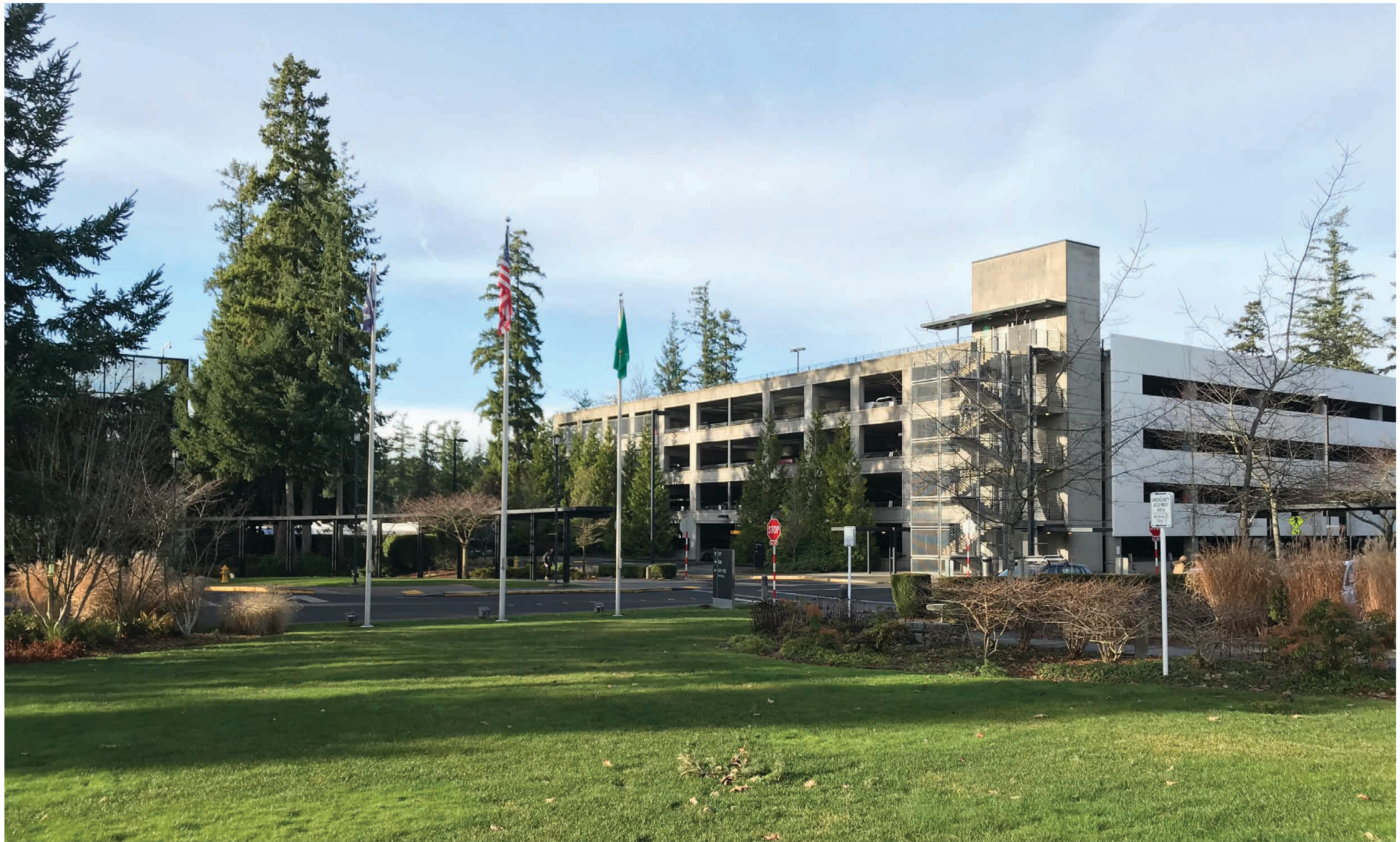
OPEN SPACE PRIOR TO DEVELOPMENT