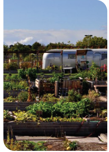
The UpGarden - The Kistler | Higbee Cahoot

Typical Entries Include: Private landscapes of all kinds (except residential) such as cultural and institutional landscapes, campuses, historic preservation, reclamation, conservation; green roofs and walls, stormwater management, sustainable design; landscape art or installation; interior landscape design; and more.