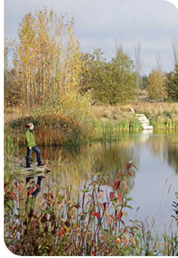
Magnuson Park - Berger Partnership

Typical Entries Include: Public landscapes of all kinds, such as parks, plazas, campuses, streetscapes, trails, historic preservation, reclamation, conservation; stormwater management, sustainable design; design for transportation or infrastructure; landscape art or installation; and more.