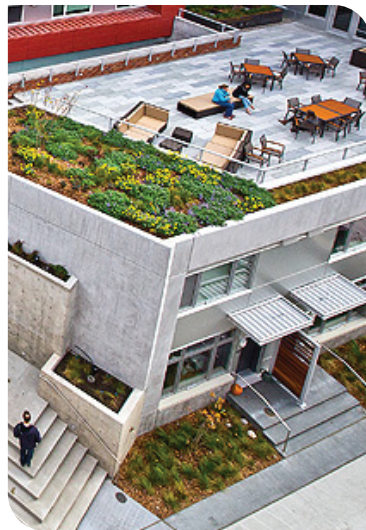
Stack House Multi-Family Development - Berger Partnership

Typical Entries Include: Single or multi-family residential projects; activity areas for cooking, entertaining, recreation or relaxation; sustainable landscape applications; new construction or renovation projects; historic preservation, rehabilitation, or restoration; affordable landscape concepts and innovations; rooftop gardens; and more.