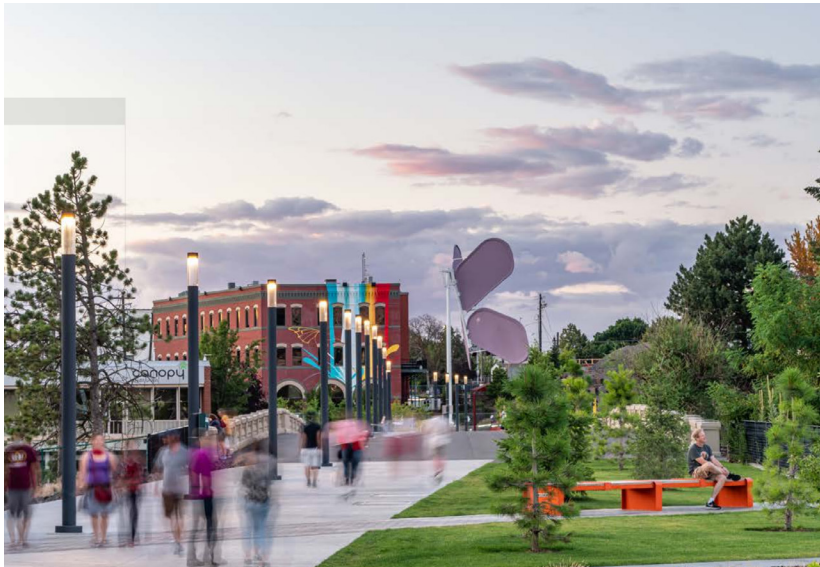
Spokane Riverfront - Berger Partnership

TYPICAL ENTRIES INCLUDE Public landscapes of all kinds, such as parks, plazas, campuses, streetscapes, trails, historic preservation, reclamation, conservation; stormwater management, sustainable design; design for transportation or infrastructure; landscape art or installation; and more.