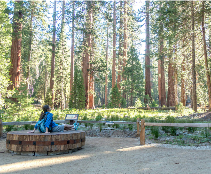
Restoration of the Mariposa Grove - Mithun