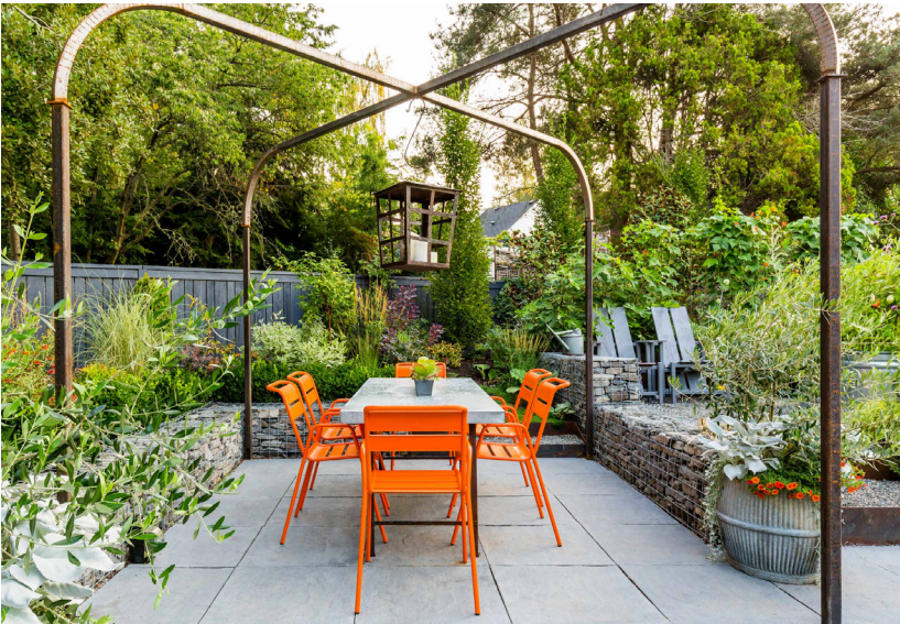
Gillian's Garden - Land Morphology

TYPICAL ENTRIES INCLUDE Single family homes; high rise, multi-family and custom home developments; transit oriented development; historic preservation, renovation or conservation projects; senior or assisted living developments; private or small gardens; new urbanism projects with multifamily development; projects located in Opportunity Zones; and more.