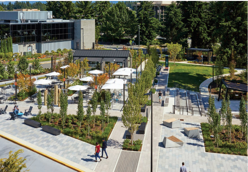
Microsoft 121 + 122 - Brumbaugh Associates

TYPICAL ENTRIES INCLUDE Private landscapes of all kinds (except residential) such as cultural and institutional landscapes, campuses, historic preservation, reclamation, conservation; green roofs and walls, stormwater management, sustainable design; landscape art or installation; interior landscape design; and more.