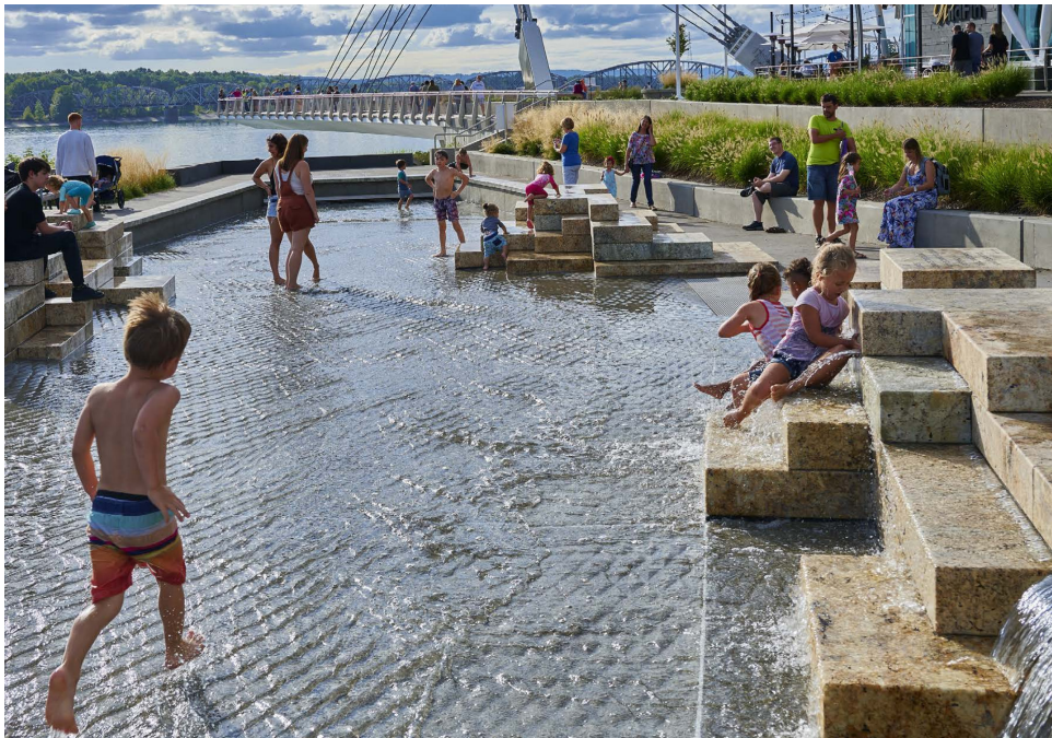
Vancouver Waterfront - PWL Partnership