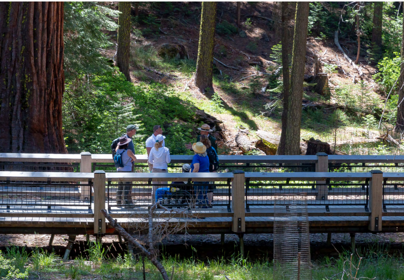
Restoration of the Mariposa Grove - Mithun

TYPICAL ENTRIES INCLUDE Urban, suburban, rural, or regional planning efforts; development guidelines; transportation, town, or campus planning; plans for reclamation of brownfield sites; environmental planning in relation to legislative or policy initiatives or regulatory controls; cultural resource reports; natural resources protection; historic preservation planning; and more.