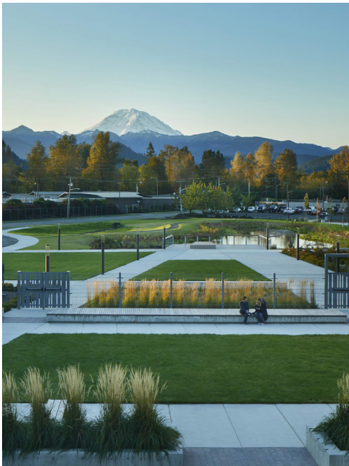
Enumclaw High School - Weissman Design Group